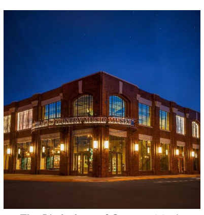
The Birthplace of Country Music Museum in Bristol

Next up is <u>Bristol</u>, the congressionally designated official Birthplace of Country Music and home to <u>The Birthplace of Country Music Museum</u> (pictured right), an affiliate of the Smithsonian Institution. The notable "Bristol Sessions" occurred in Bristol in the summer of 1927 and are considered by many to be the "Big Bang" of country music. These sessions included performances by the Carter Family (known as the first family of country music) and Jimmie Rodgers, who is referred to as the "Father of Country Music" and was also the first person inducted into the Country Music Hall of Fame.