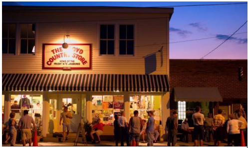
The Floyd Country Store

Your journey will then bring you to <u>Hillsville</u>, home of the Hillsville Concert Series and Hillsville Jam Sessions. Nearby, the <u>Blue Ridge Music Center</u> greets you with toe-tapping sounds from fiddles, banjos, and guitars! <u>The Blue Ridge Music Center</u> is also home to the interactive Roots of American Music Museum Exhibit and the starting point for two scenic hiking trails.