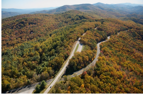
The Blue Ridge Parkway

Before heading home, be sure to visit <u>Black Dog Salvage</u>, featuring a stunning variety of antiques and countless other unique items. Black Dog Salvage is also the home of the popular television series, <u>Salvage Dawgs!</u> When it's time to depart Roanoke, take a ride on the famed <u>Blue Ridge Parkway</u>, known for some of the nation's most spectacular mountain views.