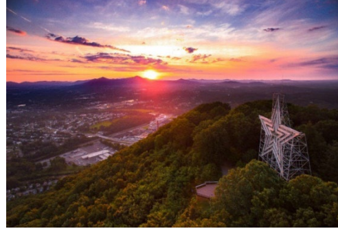
The Roanoke Star Overlook at Mill Mountain

Mountain Biking Capital, this city is full of opportunities for outdoor adventure. Popular attractions to explore include the <u>Virginia Museum of Transportation</u>, the <u>Roanoke Star Overlook at Mill Mountain</u> for sweeping views of the city and mountains, the <u>Taubman Museum of Art</u>, and the <u>Roanoke Pinball Museum</u>. Enjoy a restful night at the <u>Hotel Roanoke</u>, a Tudor-style hotel built in 1882 and listed on the National Register of Historic Places.