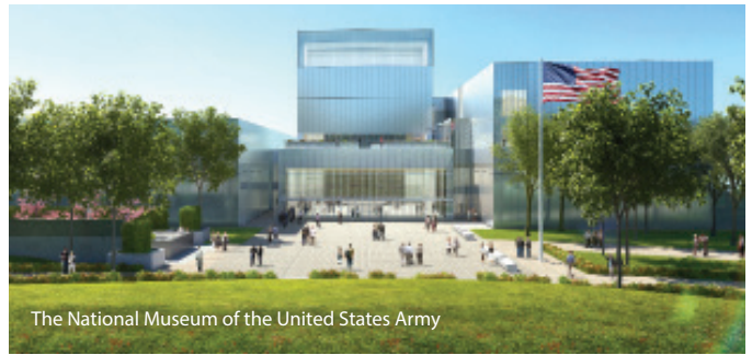
The National Museum of the United States Army

Enjoy a tasting and tour at Port City Brewing Company . An award-winning craft brewery and proud producer of an exciting line of hand-made, great quality, locally crafted beers. Its name comes from Alexandria's rich and colorful origins as an important colonial seaport, and later, a major brewing center, home to the largest brewery in the southern United States.