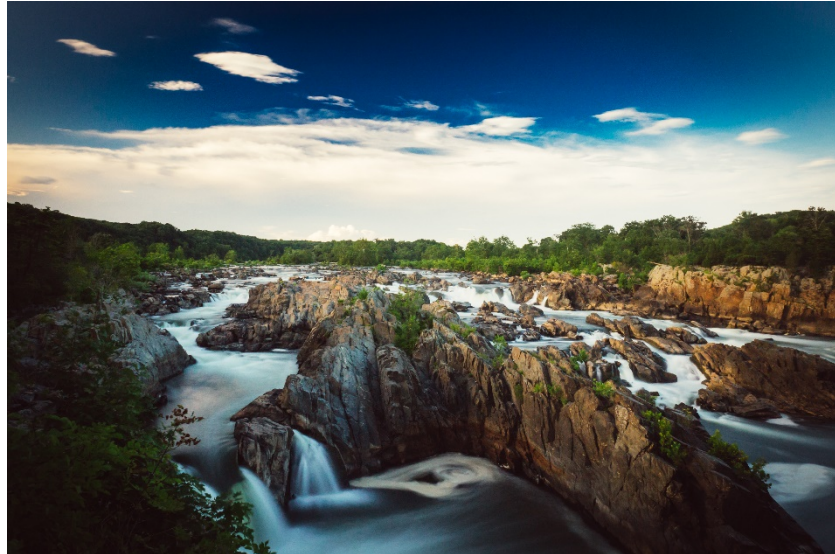
Great Falls National Park

Before leaving Northern Virginia, stop by the remarkable Great Falls National Park for an opportunity to enjoy the outdoors. This 800-acre outdoor adventure escape will delight you with its stunning waterfalls and sweeping views. Depart with fond memories and souvenirs from your unforgettable visit to Virginia.