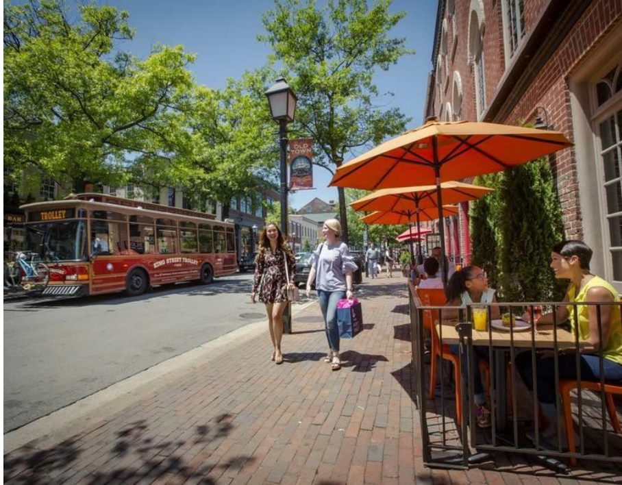
Old Town Alexandria

With more than 300 wineries, Virginia is one of the largest wine producers in the United States, and Northern Virginia is the perfect place to sip some of these fine offerings. Nearby Loudoun County boasts more than 40 wineries and tasting rooms, certain to deliver a wine experience you will never forget. There are also craft breweries, cideries, and distilleries all eager to welcome you for a visit.