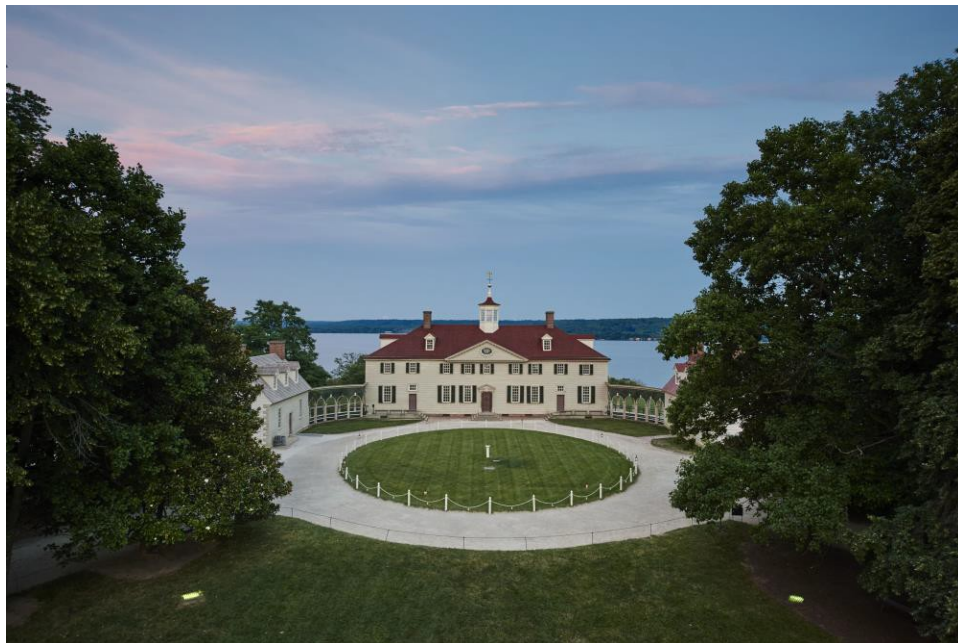
George Washington's Mount Vernon

Northern Virginia has been dubbed "Virginia's Cultural Region," due to its vast array of shopping options, fine dining establishments, and world-class historic attractions. There is so much to experience and visit in the region, whether you have only a few hours or multiple days to explore.