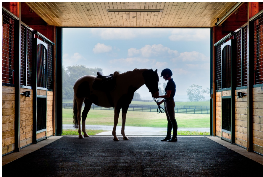
Salamander Resort & Spa

When it's time to relax before continuing your journey in Virginia, enjoy a luxury stay at the region's Salamander Resort & Spa in Middleburg or Lansdowne Resort and Spa in Leesburg. Both properties feature upscale accommodations, offering world-class spa experiences to heal the mind, body and soul. Enjoy a round of golf at Lansdowne's award-winning golf courses featuring player-friendly designs by Robert Trent Jones and Greg Norman. Or reconnect with nature at Salamander Resort & Spa and enjoy horseback riding through the resort's exceptional equestrian program.