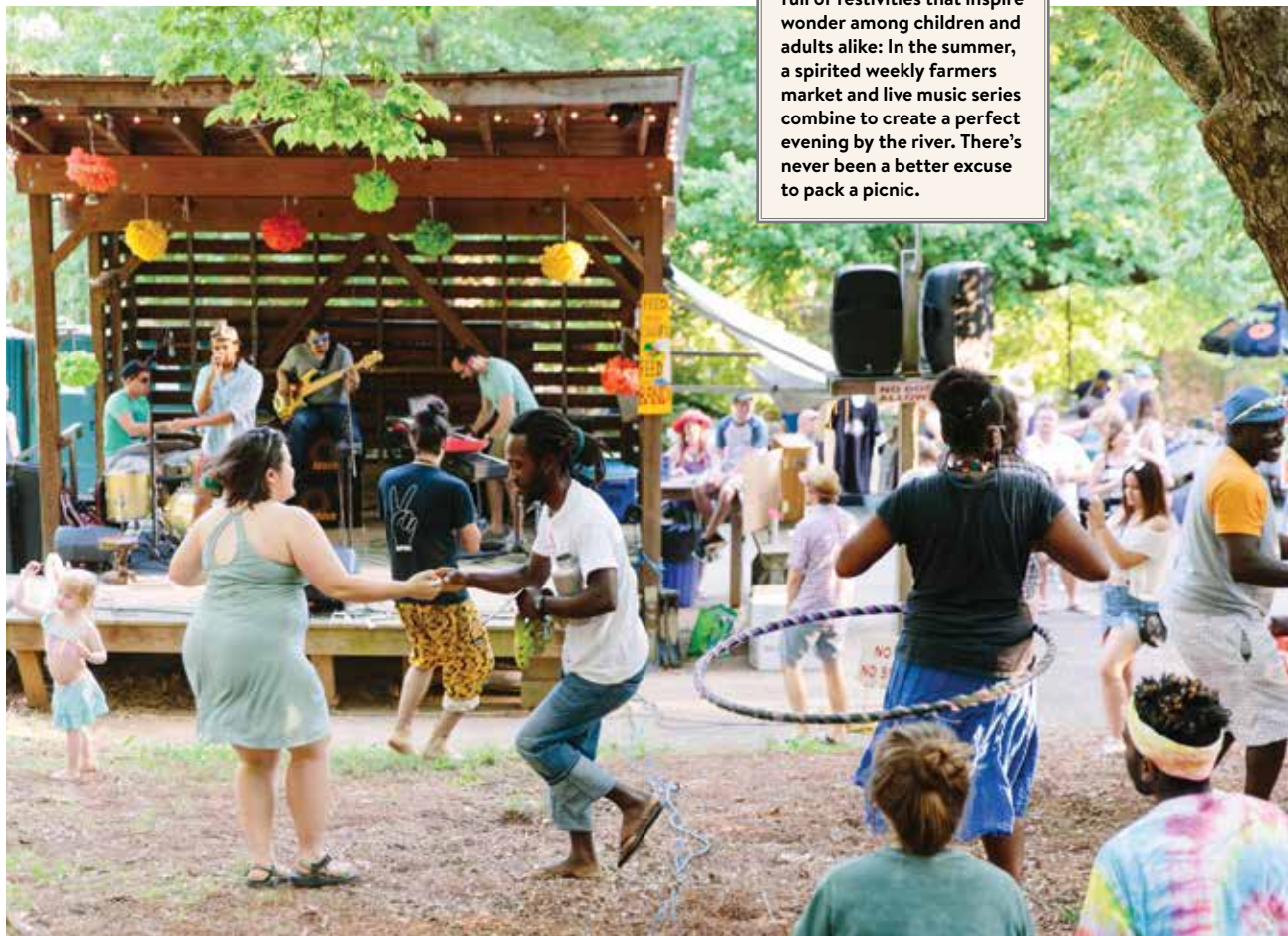
TOP LEFT: PHOTOGRAPH BY BRYAN REGAN

Saturdays in Saxapahaw are full of festivities that inspire wonder among children and adults alike: In the summer, a spirited weekly farmers market and live music series combine to create a perfect evening by the river. There's never been a better excuse to pack a picnic.