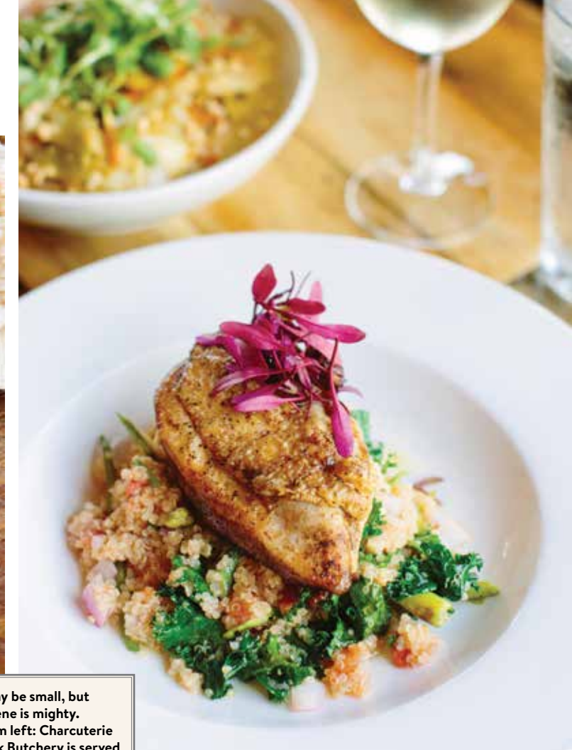
Saxapahaw may be small, but its culinary scene is mighty. Clockwise from left: Charcuterie from Left Bank Butchery is served at the neighboring Eddy Pub, where you can also find lemon honey chicken breast, a selection of North Carolina craft brews on tap, and baskets of freshly made challah, sourdough, and other breads from the in-house bakery, the Village Bakehouse.