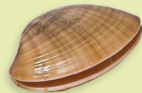
Sunray Venus Clam