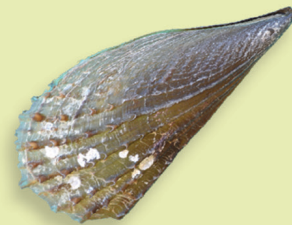
Stiff Pen Shell

Scan the shoreline and sand bars at the Florida beaches you visit and mark on the box below the shells you find. Although the collection of sea shells is generally allowed statewide, if the shell contains a living organism, leave it where you found it. Some areas of Florida have collecting laws and penalties for their violation. To be certain, check signs or ask local officials.