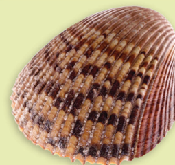
Atlantic Giant Cockle