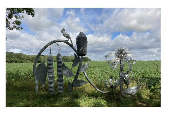
Sandy Lane to Woodhall Spa approx. 2.8 km (1 ¾ miles)

CYCLISTS MUST turn left onto Sandy Lane and then right onto Horncastle Road to reach the centre of Woodhall Spa. (3.1km)