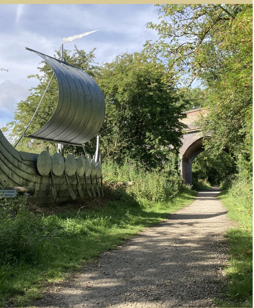
6.25 MILES (10 KM) OF MAINLY TRAFFIC FREE ROUTE FROM HORNCASTLE TO WOODHALL SPA WITH A 1.25 MILE (2 KM) EXTENSION TO KIRKSTEAD TO CONNECT WITH THE WATER RAIL WAY