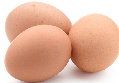
VBC is proud to offer cage-free eggs.