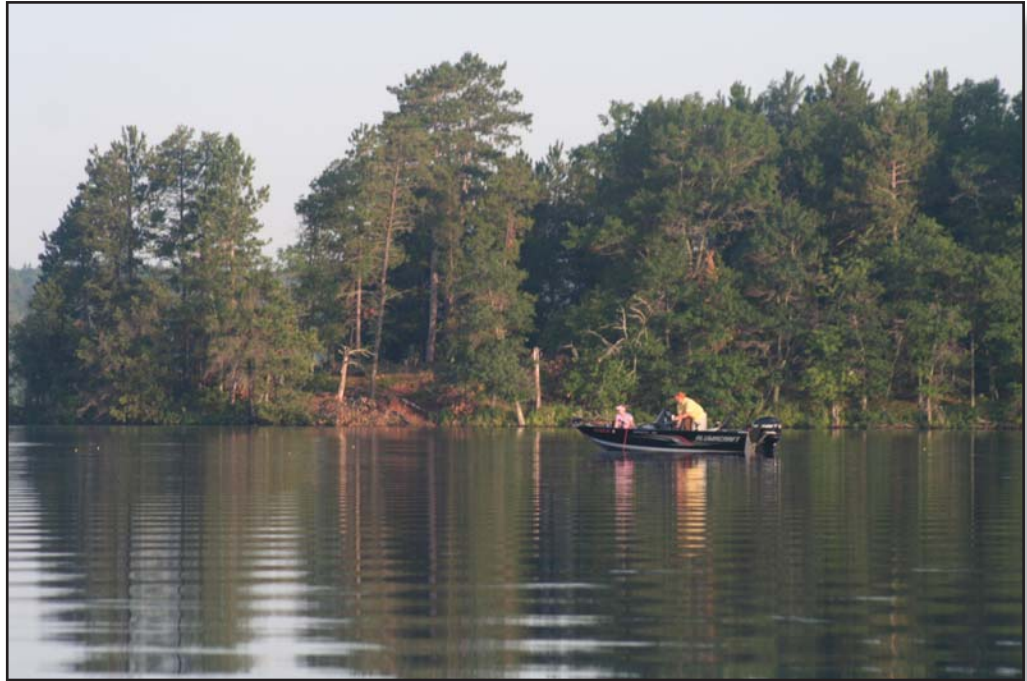
Anglers work the Minong Flowage on an early August morning. The flowage offered excellent pike and largemouth bass fishing in Washburn County.

weed growth and that’s good for bass, especially big bass,” he said. “New weeds mean fresh oxygen and the opposite for dying weeds. New weeds keep popping up on lakes even into the fall. The newest green weeds will mean fish. Fish leave vegetation that’s dying in search of different emergent growth.”