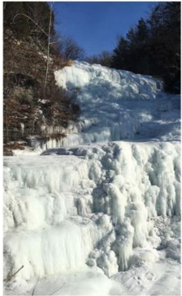
Hector Falls in winter splendor

The 2021 Annual Awards will be announced on April 7 during the After Hours Mixer, which will be virtual but hosted by the Finger Lakes Boat Museum. We look forward to honoring our dedicated Chamber and community members for their good work!