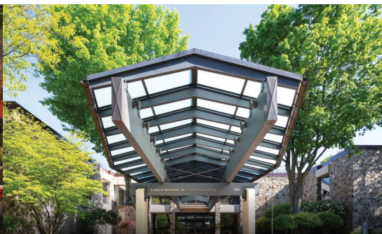
Louis V. Gerstner, Jr. Center for Learning