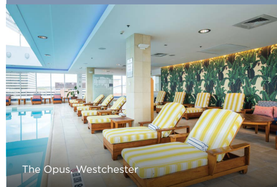
The Opus, Westchester