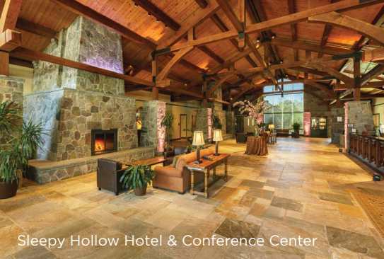
Sleepy Hollow Hotel & Conference Center