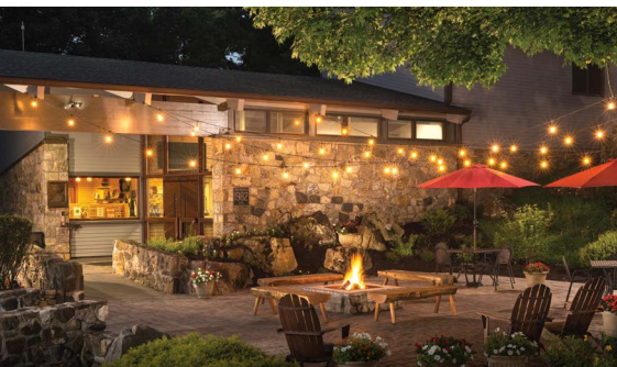
Edith Macy Center

Major highways: I-87/New York State Thruway, I-95/New England Thruway, I-287/Cross-Westchester Expressway, I-684.