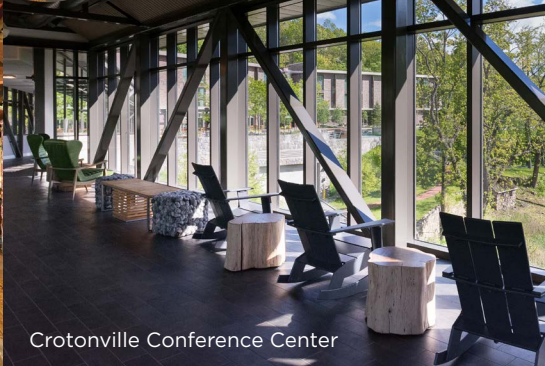
Crotonville Conference Center