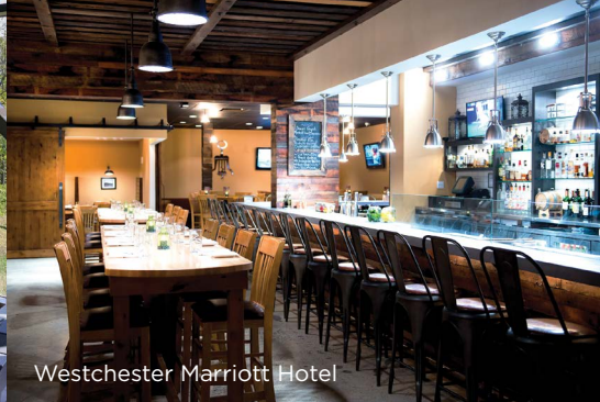
Westchester Marriott Hotel