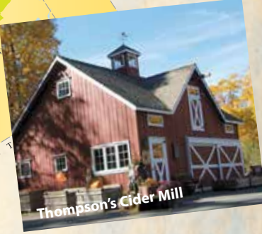
Thompson's Cider Mill