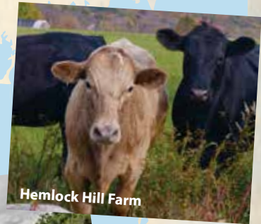
Hemlock Hill Farm