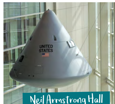
Neil Armstrong Hall of Engineering