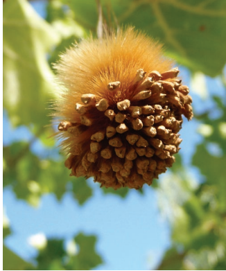
Explore eighteen scenic miles of natural tranquility.