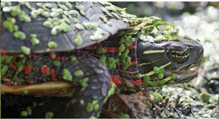
Nature always wears the color of the spirit. Ralph Waldo Emerson