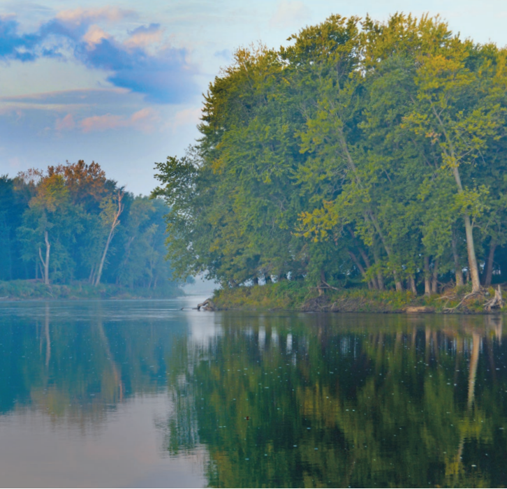
Of all the paths you take in life, make sure a few of them are dirt. John Muir