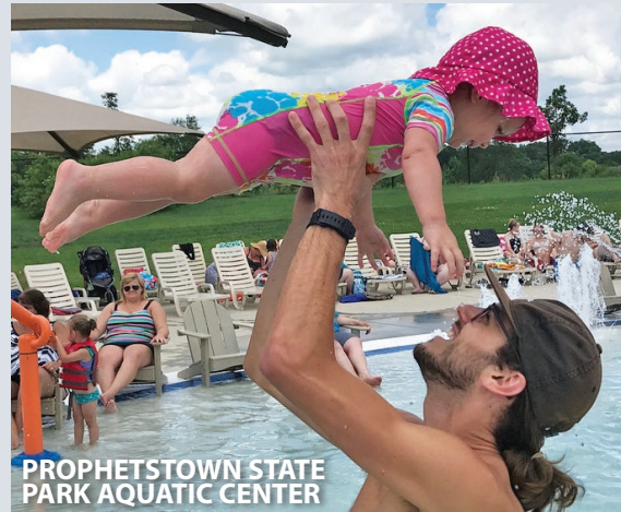
PROPHETSTOWN STATE PARK AQUATIC CENTER

See FISHING & BOATING for these locations; Bicentennial Nature Area, Fairfield Lakes, Tapawingo Park, Wildcat Park