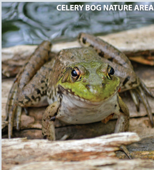
CELERY BOG NATURE AREA

1620 Lindberg Rd., West Lafayette 765-775-5172, westlafayette.in.gov/parks — Celery Bog Nature Area contains approximately 195 acres of wetlands, adjacent woods and fields. Lilly Nature Center provides an excellent destination where many topics can be studied. A meeting room is available for rent for educational or environmental meetings. Admission is free. #35