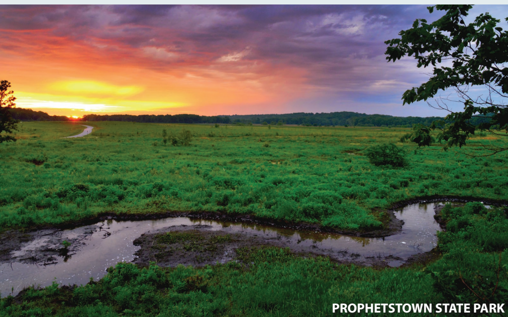
PROPHETSTOWN STATE PARK