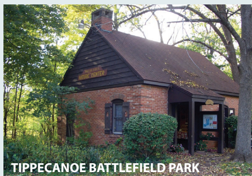
TIPPECANOE BATTLEFIELD PARK

Fort Ouiatenon: 3129 S. River Rd. West Lafayette — 34 acres; Wabash Riverfront park with picnic areas, 2 shelter houses, grills, restrooms, boat launch. Contact the Tippecanoe County Historical Association for programming information at 765-476-8411. #5