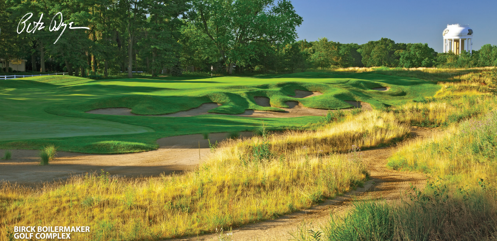
BIRCK BOILERMAKER GOLF COMPLEX