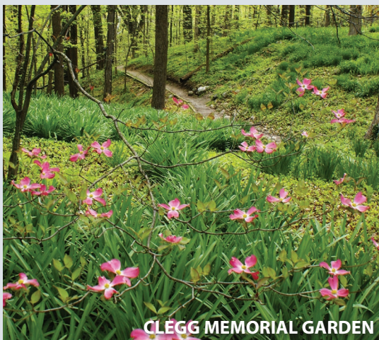
CLEGG MEMORIAL GARDEN

Clegg Memorial Garden: 1782 N. 400 E. Lafayette, 765-423-1605 — Overlooks and runs alongside the Wildcat Creek. Offers a naturalistic setting including prairie and oak savanna restorations, extensive beds of wildflowers, labelled trees, bridges and nature trails. Open during daylight hours, admission is free. #47