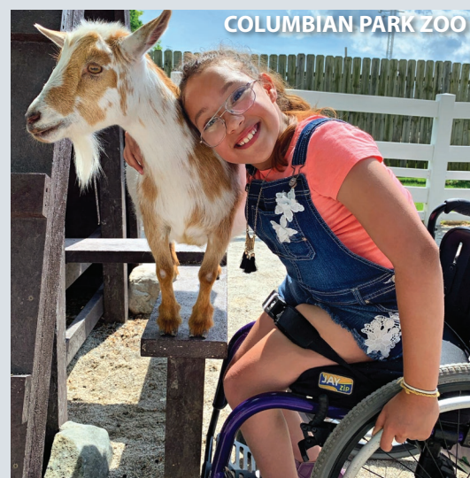
COLUMBIAN PARK ZOO

North Darby Park: 14 Darby Ln. — 0.8 acre; multi-age playground, basketball court and open green space. #30