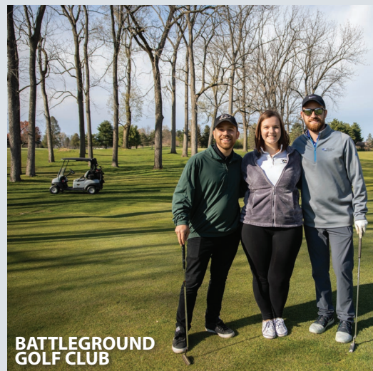
BATTLEGROUND GOLF CLUB

3224 US 52 W., West Lafayette 765-463-2332, wlgcc.com — 18 holes featuring well-manicured fairways and greens, pristine scenery, and challenging sand bunkers and water hazards, driving range, rental clubs, bar & grill and proshop.