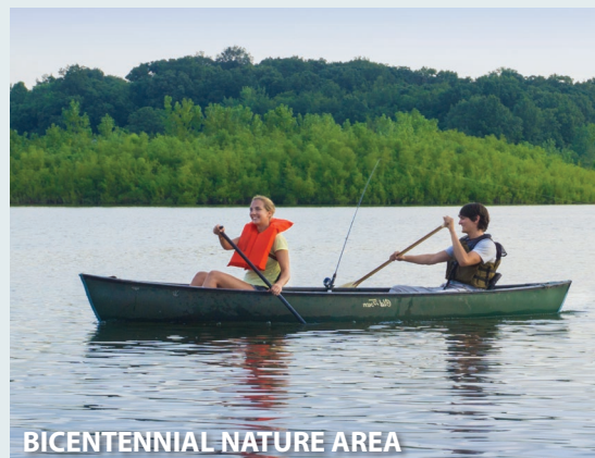
BICENTENNIAL NATURE AREA

Wildcat Park: 5129 Eisenhower Rd., Lafayette — 53 acres; confluence of north and south forks of the Wildcat Creek, shelter house, access for canoeing, picnic areas, nature observation, restrooms, grills and accessible fishing pier. #14