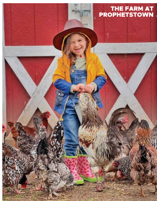
THE FARM AT PROPHETSTOWN

WOLF PARK: 4004 E. 800 N., Battle Ground, 765-567-2265, wolfpark.org — 78 acres of beautiful Indiana prairie. Open daily for guided tours, summer camps, workshops, seminars and special events. Visitors can hit the trail to see the resident ambassador wolves, foxes and bison. Howl Nights offer visitors a personal view of the wolves and a chance to howl with the pack. Tour reservations encouraged. Admission charged. #53