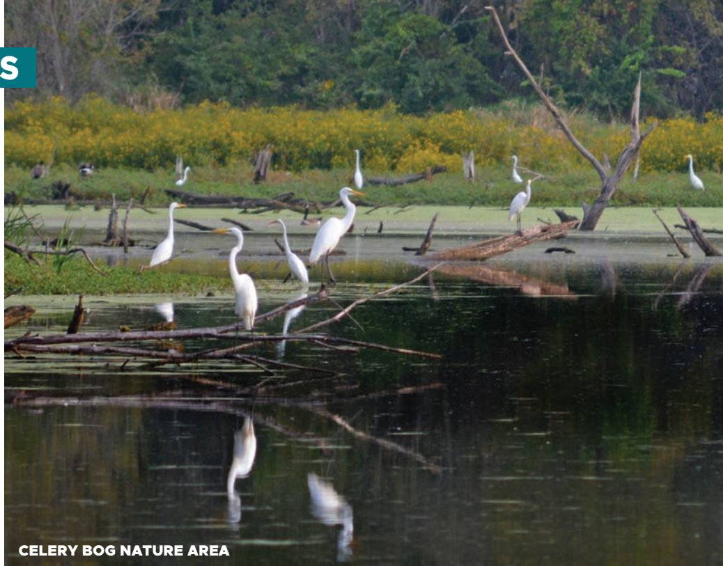
CELERY BOG NATURE AREA

LINCOLN PARK: 255 Lincoln St. — 0.5 acres; shelter, playground and picnic area. #39