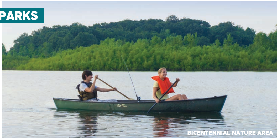
BICENTENNIAL NATURE AREA

HERON ISLAND: small island in the Wabash River, just west of Davis Ferry Park — 11 acres set aside as a nature preserve, undeveloped and poison ivy proliferates. #7