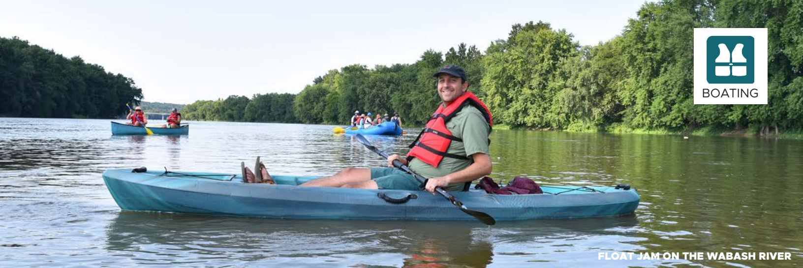
FLOAT JAM ON THE WABASH RIVER