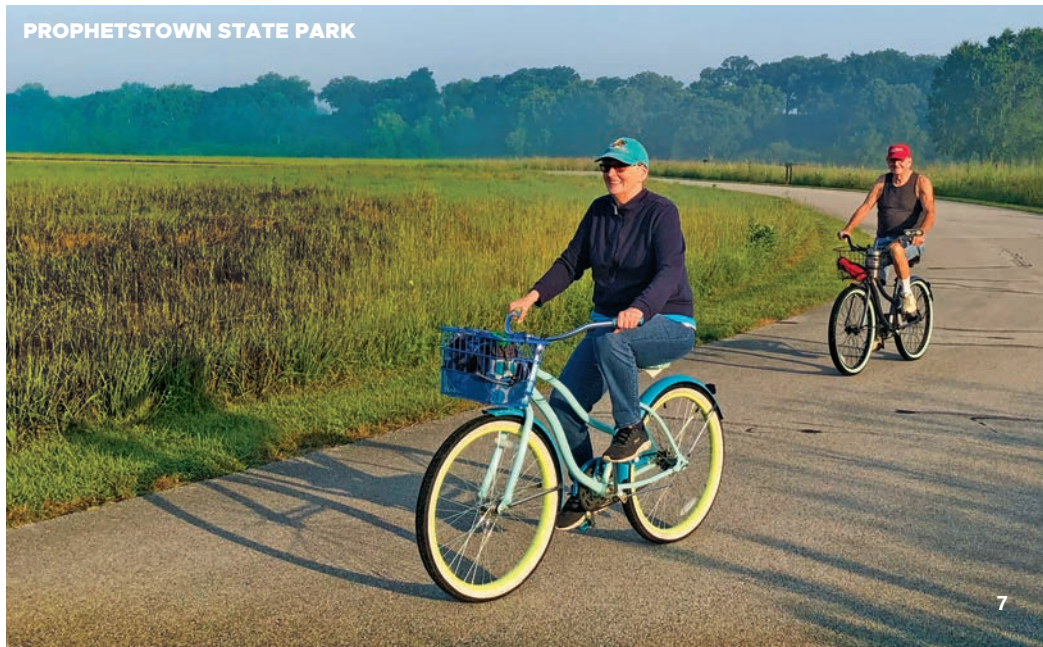
PROPHETSTOWN STATE PARK

VIRTUOUS CYCLES 215 N. 10th St., Lafayette, 765-807-6557