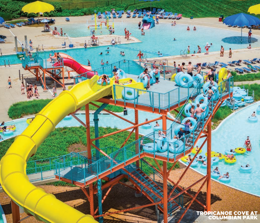
TROPICANOE COVE AT COLUMBIAN PARK