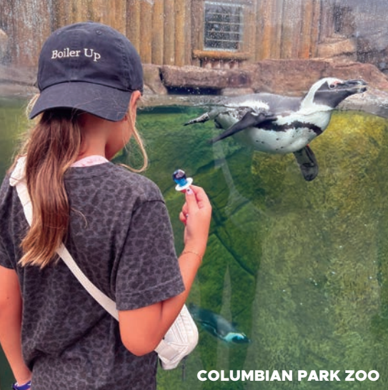
COLUMBIAN PARK ZOO

SIA SOUTH TIPP PARK: 300 Fountain St. — 0.8 acre; multi-age and tot playgrounds, basketball court and picnic shelter. #30