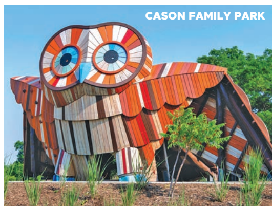
CASON FAMILY PARK

222 N. Chauncey Ave., West Lafayette 765-775-5110, westlafayette.in.gov/parks