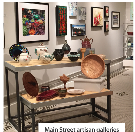
Main Street artisan galleries

11:30 a.m. to 1:00 p.m. — Lunch at East End Grill . Devour seafood, steak, chicken and duck, salads and sandwiches at this downtown eatery.