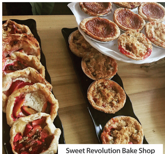
Sweet Revolution Bake Shop

10:00 to 11:30 a.m. — Explore the many artistic shops and galleries located downtown, on Main Street. Artists' Own, LE Originals, Retail Therapy, Two Tulips and more! Stop into Scones and Doilies to try some locally made treats.