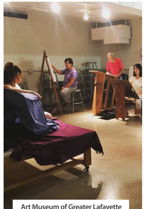
Art Museum of Greater Lafayette

Visit LAFAYETTE WEST LAFAYETTE TWO GREAT CITIES, ONE GREAT UNIVERSITY.