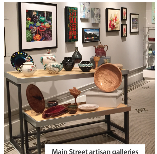
Main Street artisan galleries