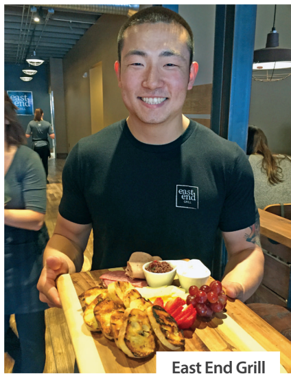
East End Grill

Check out Beyond the Vine Wine Tours (for groups up to 14 people, transportation provided) beyondthewineindiana.com