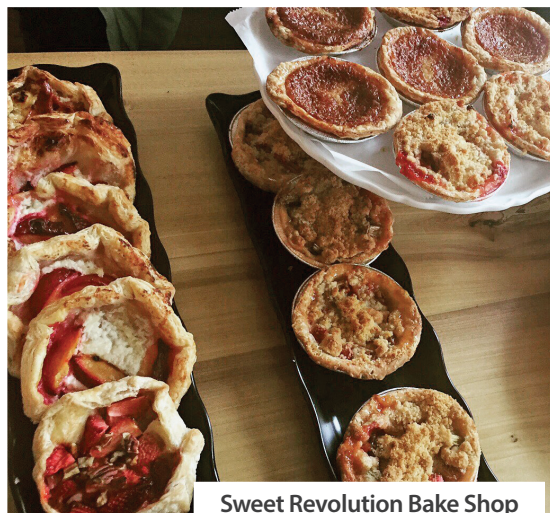
Sweet Revolution Bake Shop

1:50 to 2:50 p.m. — Relax with a nice glass of wine at the Cellar Wine Bistro .