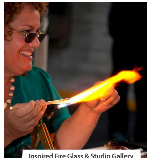
Inspired Fire Glass & Studio Gallery