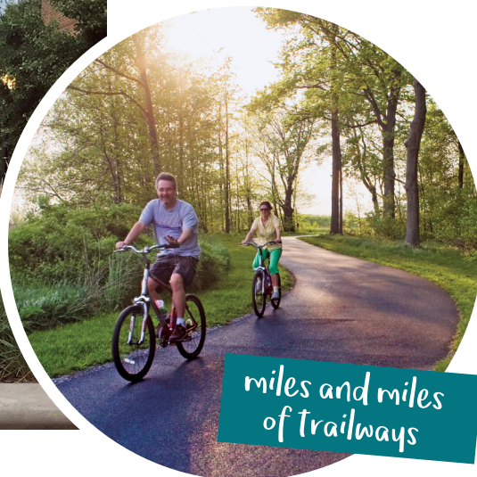
miles and miles of trailways