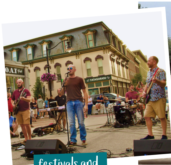
festivals and events