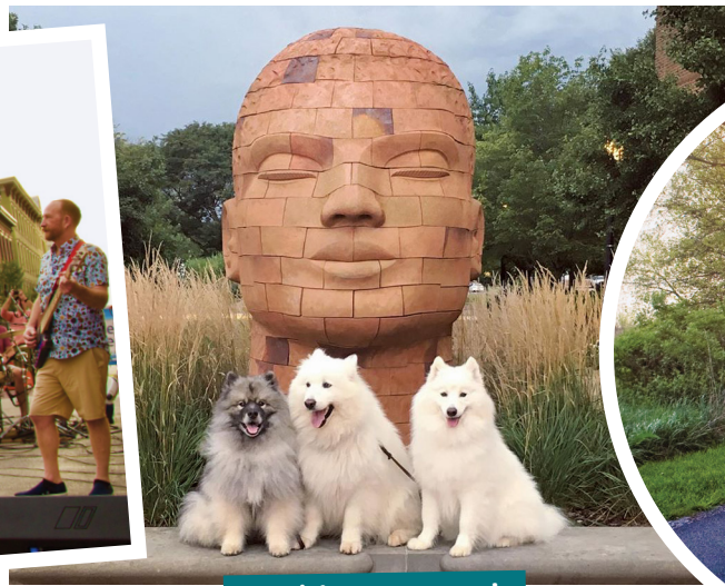
public art trail