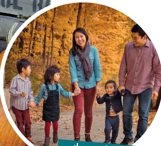
miles and miles of trailways