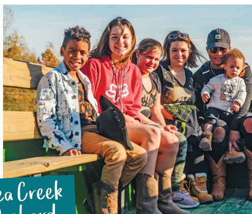
Wea Creek Orchard