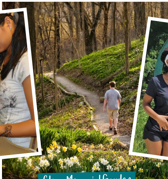
Clegg Memorial Garden