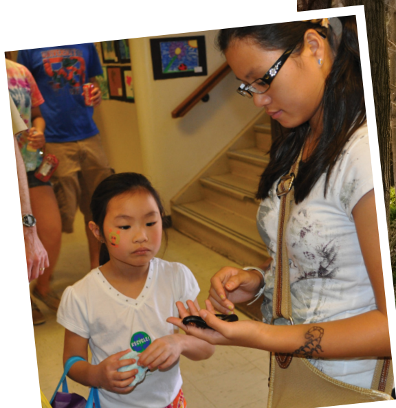
Purdue Bug Bowl