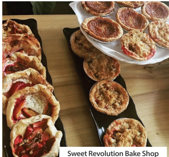
Sweet Revolution Bake Shop

10:00 to 11:30 a.m. — Explore the many artistic shops and galleries located downtown, on Main Street. Artists' Own, LE Originals, Fountain Gallery and more! Stop into McCord Candies to try some locally made candy.