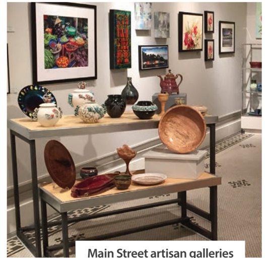
Main Street artisan galleries

11:30 a.m. to 1:00 p.m. — Lunch at La Scala Italian Restaurant . A chef and family owned restaurant in downtown Lafayette 'that grows much of their own produce as well as features other local producers.