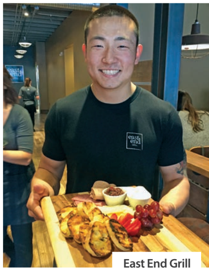
East End Grill