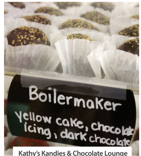
Kathy's Kandies & Chocolate Lounge