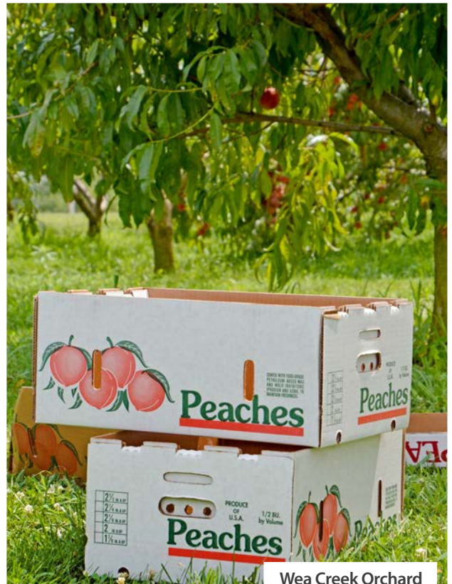
Wea Creek Orchard

12:30 to 2:00 p.m. — Pick up lunch at Arni's at Columbian Park and then enjoy your food at one of the many picnic shelters in the park. Don't forget to pick up dessert, or your favorite flavored soda at The Original Frozen Custard too!