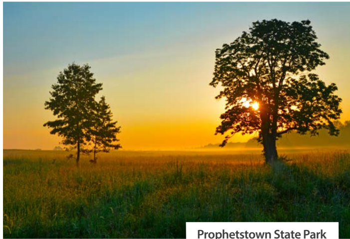
Prophetstown State Park

12:45 a.m. to 2:15 p.m. — Lunch at The Bryant .