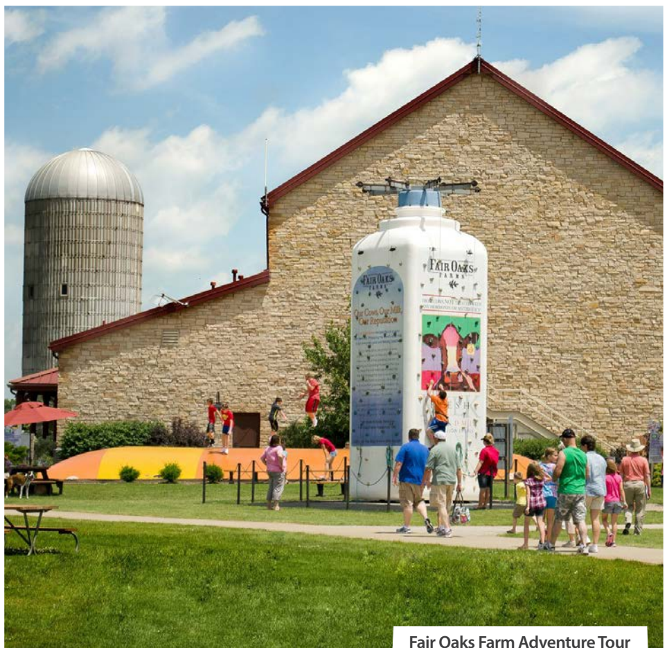
Fair Oaks Farm Adventure Tour

3:00 p.m. Central / 4:00 p.m. Eastern — Depart for home.