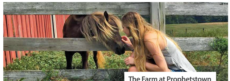
The Farm at Prophetstown