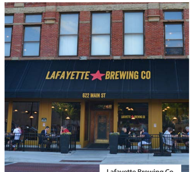
Lafayette Brewing Co.

7:30 to 10:00 p.m. — Roast marshmallows at your private fire pit at Exploration Acres while exploring their 18-acre corn maze and other activities (Seasonal).