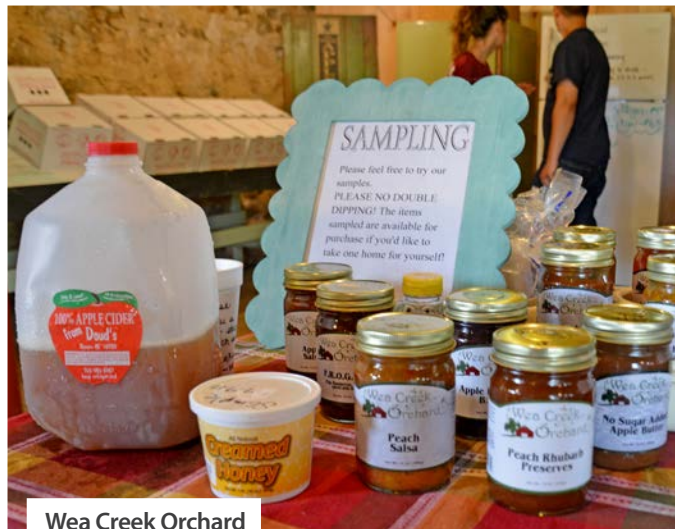
Wea Creek Orchard

1:45 to 2:30 p.m. — Meet a step on guide for a tour of Purdue University and Downtown Lafayette - West Lafayette . Learn about all of Purdue, but also about the greenhouses, Butcher Block and Purdue Cheese.