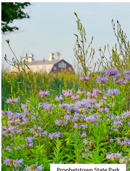
Prophetstown State Park

10:30 a.m. to 12:30 p.m. — Discover Prophetstown State Park . Shaped by glacial ice, moving water, fire, and human hands, this park is the site where the Native American people hunted and lived along the Tippecanoe and Wabash rivers. Paired with The Farm at Prophetstown , guests can experience 1920s farming techniques and learn about Native American Life in the early 1800s. Enjoy a program about using wild plants in cooking or a canning/preservation class.