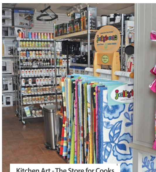
Kitchen Art - The Store for Cooks

1:00 to 3:20 p.m. — Lunch at a strip that includes Thai Essence, Penn Station, West Side Diner and Dominos. After lunch, do some shopping at Kitchen Art - The Store for Cooks and Gretel's Fine Gifts .