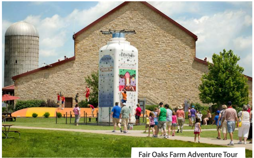
Fair Oaks Farm Adventure Tour