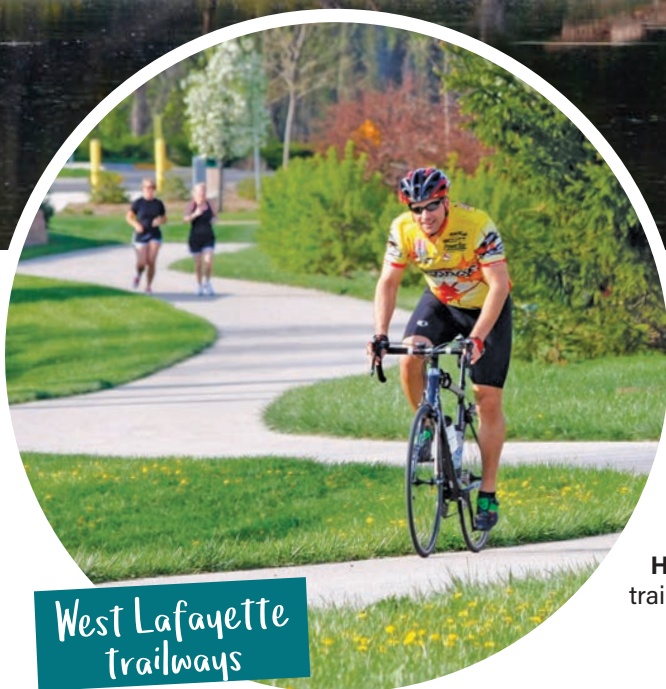
West Lafayette trailways