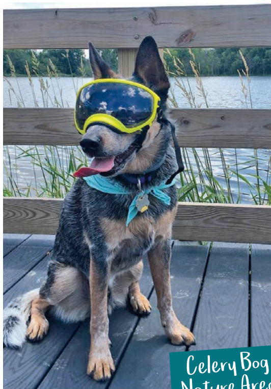
Celery Bog Nature Area

corner of LaGrange and Hamilton St. — 6 acres; playground and picnic shelter. #45