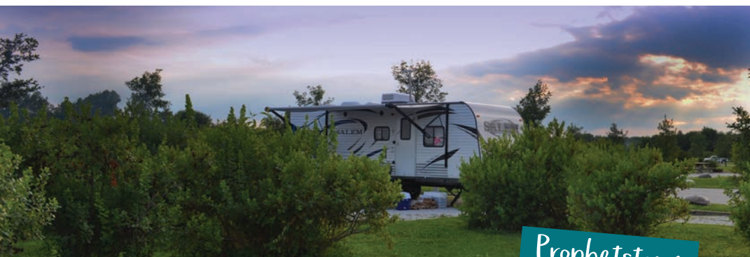
Prophetstown State Park