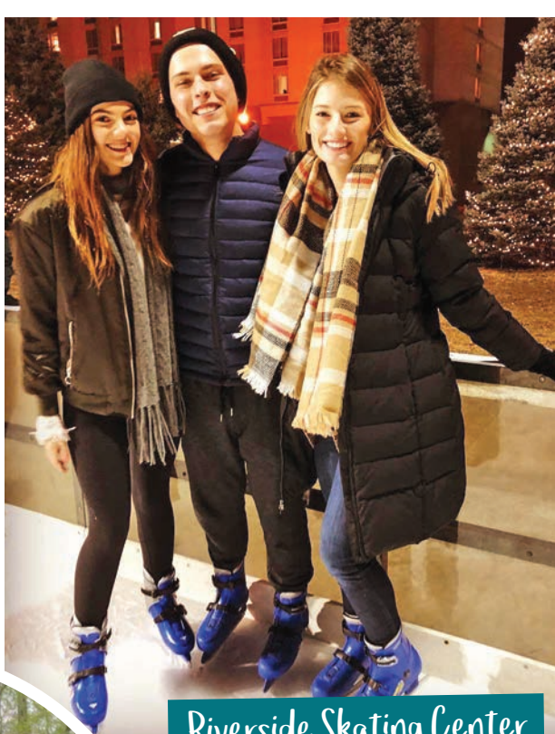
Riverside Skating Center