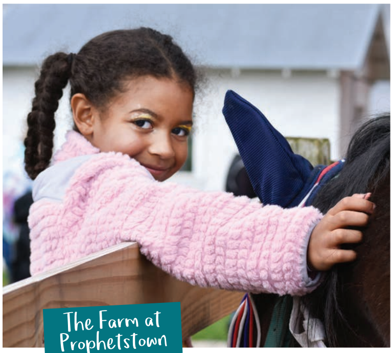
The Farm at Prophetstown