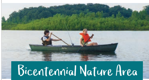
Bicentennial Nature Area

WOLFE'S LEISURE TIME CAMPGROUND: 7414 Old SR 25 N. Americus — Private camp, boat ramp with fee.