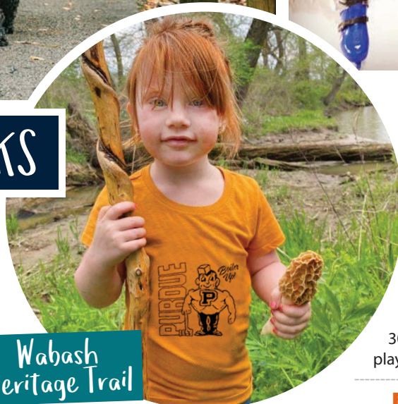
Wabash Heritage Trail

HAPPY HOLLOW PARK: 1301 Happy Hollow Rd. — 81 acres; dog park, accessible playground, picnic shelters available for rent, cookout facilities, restrooms, softball and volleyball areas and 3+ miles of trails, including a section of the Wabash Heritage Trail. #37