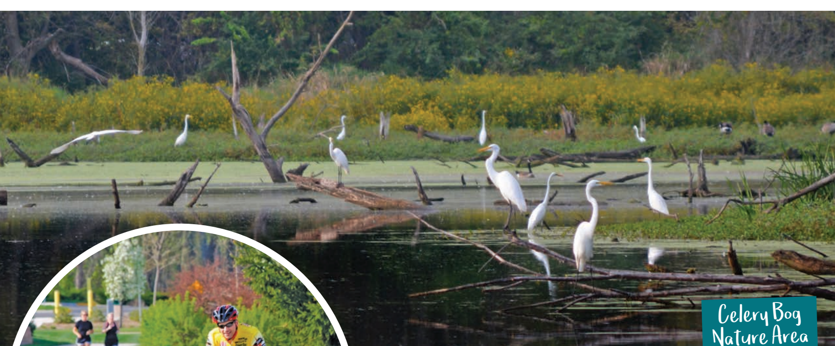
Celery Bog Nature Area