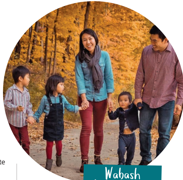
Wabash Heritage Trail

TAPAWINGO PARK: 100 Tapawingo Dr. West Lafayette — Paved, section of the Wabash Heritage Trail (see NATURE LEARNING).