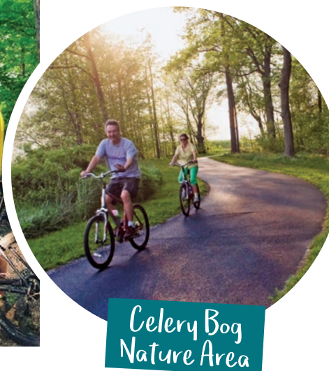
Celery Bog Nature Area

4449 SR 43 N., West Lafayette — 3 mile, intermediate singletrack trails. Trail is shared with hikers and cross country runners. Make sure to stay on the trail. Trail closes during special amphitheater events. The Wabash Heritage Trail is close and bikes are not allowed on it.