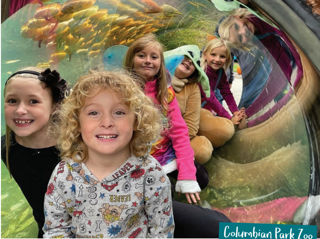
Columbian Park Zoo