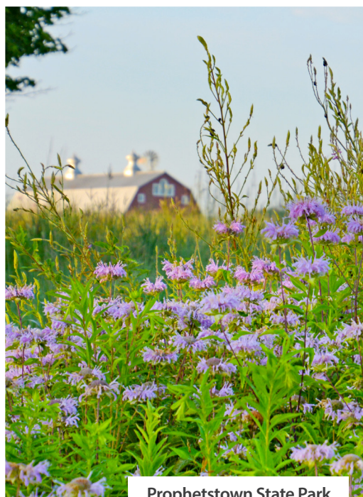
Prophetstown State Park

10:30 a.m. to 12:30 p.m. — Discover Prophetstown State Park . This park is the site where the Native American people hunted and lived along the Tippecanoe and Wabash rivers. Paired with The Farm at Prophetstown , guests can experience 1920s farming techniques and learn about Native American Life in the early 1800s. Enjoy a program about using wild plants in cooking or a canning/preservation class.