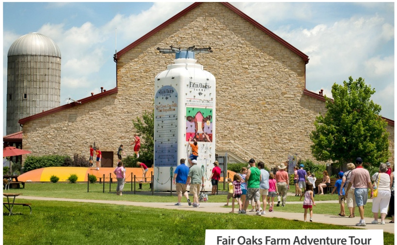
Fair Oaks Farm Adventure Tour