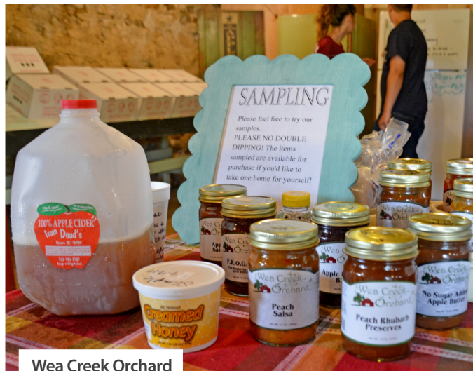
Wea Creek Orchard

1:45 to 2:30 p.m. — Meet a step on guide for a tour of Purdue University and Downtown Lafayette-West Lafayette . Learn about all of Purdue, as well as the greenhouses, Butcher Block and Purdue Cheese.