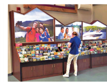
Brochure rack at Hooksett Welcome Center (I-93 North).