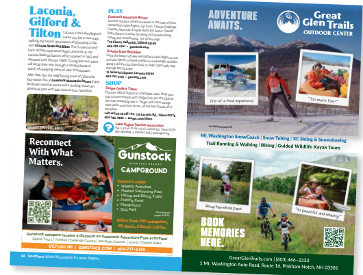
SAMPLE AD SIZES

Please note, we do not offer design services in-house. All graphic design elements are your responsibility, including edits to current ads.