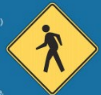
NH 28A, Manchester