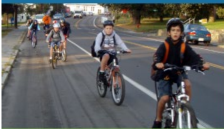
NH 116, Littleton

Bicyclists have the same rights and duties as drivers of motor vehicles. (RSA 265:143) Bicyclists must stop at stop signs and red lights, yield to pedestrians, and ride with traffic.