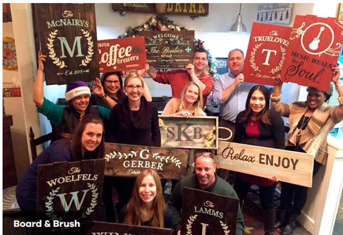
Board & Brush

At Blade & Timber or Axe to Grind , axe throwing is a perfect activity for friends and family. Children 10 and older are allowed to join in, though minors must be accompanied by a parent or guardian.