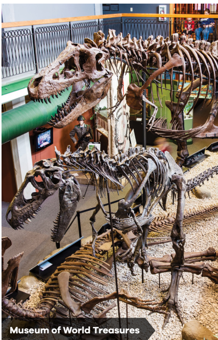
Museum of World Treasures