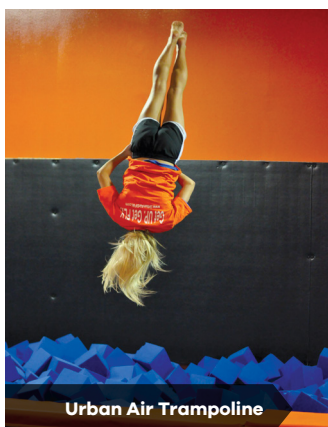
Urban Air Trampoline