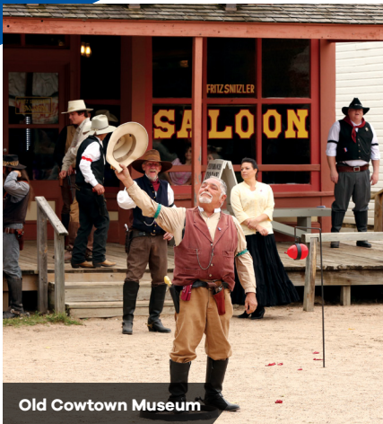
Old Cowtown Museum

CHECK OUT THESE FUN THINGS TO DO WHILE YOU'RE IN TOWN