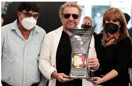
Sammy Hagar (center)