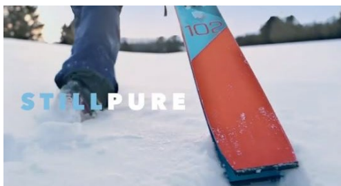
A still from an ad promoting safe outdoor activities in Michigan.