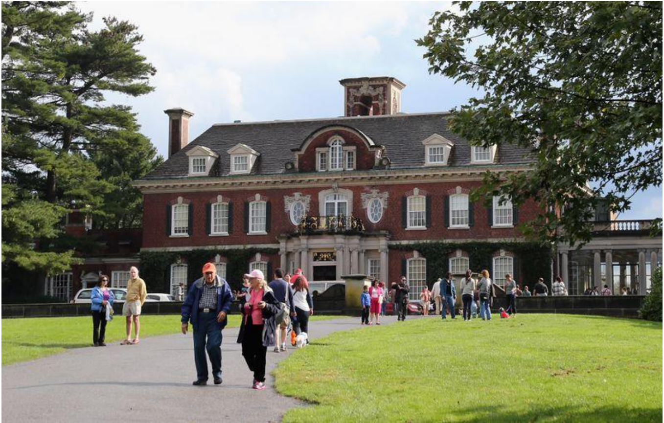
Participants arrive for a dog costume contest for Halloween at the Old Westbury Gardens on September 30, 2012 in Old Westbury, New York.

The Catskills, N.Y. (about 90 miles from NYC) - www.visitthecatskills.com