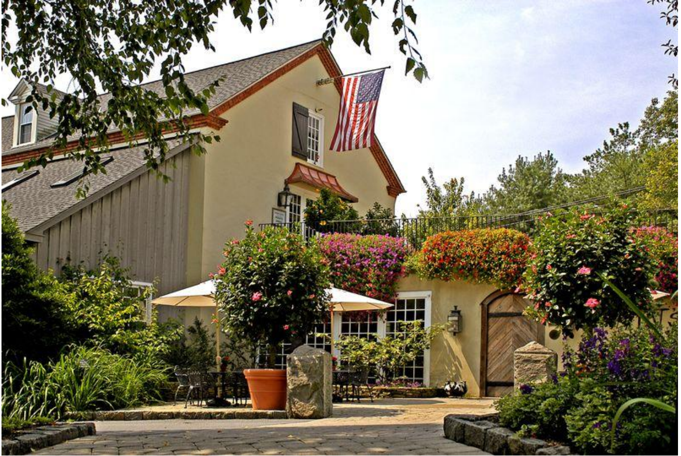
The Inn at Montchanin Village, part of Small Luxury Hotels of the World, boasts 28 swish rooms in 11 historic houses near downtown Wilmington, DE.

spot Bardea where pillowy “upside-down” pizza is a signature. End the evening at The Queen , where acts might range from drag to a Guns N’ Roses tribute band.