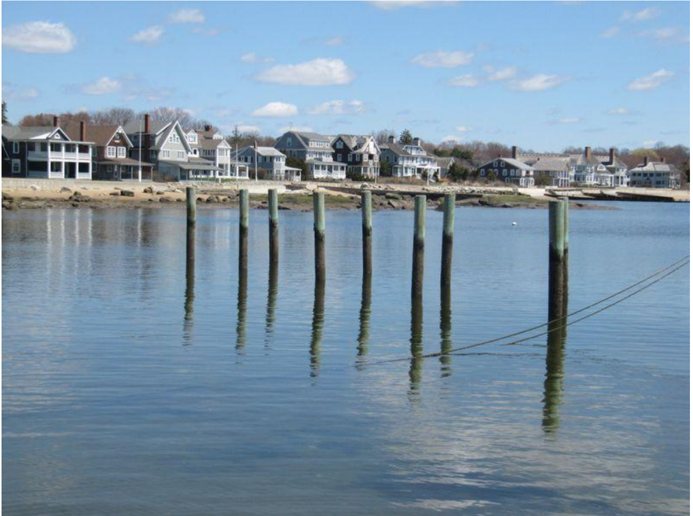
One of New England's most entrancing beach towns, Madison, CT has also been generating buzz for its restaurants and historic sites - and it's less than 100 miles from NYC.

A beloved beach spot, Madison's becoming better known for its buzzing little downtown. Find crafts from over 180 artisans at nonprofit gallery Creations . Tweet about The Audubon Shop , the state's first natural history and birdwatching shop. Leaf through R.J. Julia , one of the East Coast's greatest bookstores. Walk ten minutes west — and a couple of centuries back — to the Madison Green Historic District , whose structures date to the 17th century. Hungry? Lobster Landing , a century-old shack, serves to-die lobster rolls. Bed down at one of The Homestead's 10 luxe rooms ooze country-chic charm.