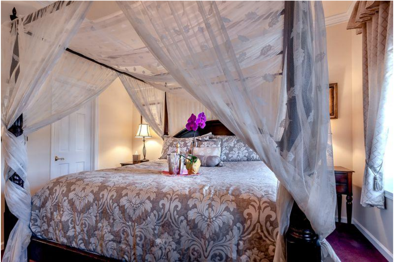
Pig Hill Inn's nine luxe rooms occupy a circa-1925 mansionette on a scenic block of Cold Spring, NY.

Philadelphia (about 90 miles from NYC) - visitphilly.com