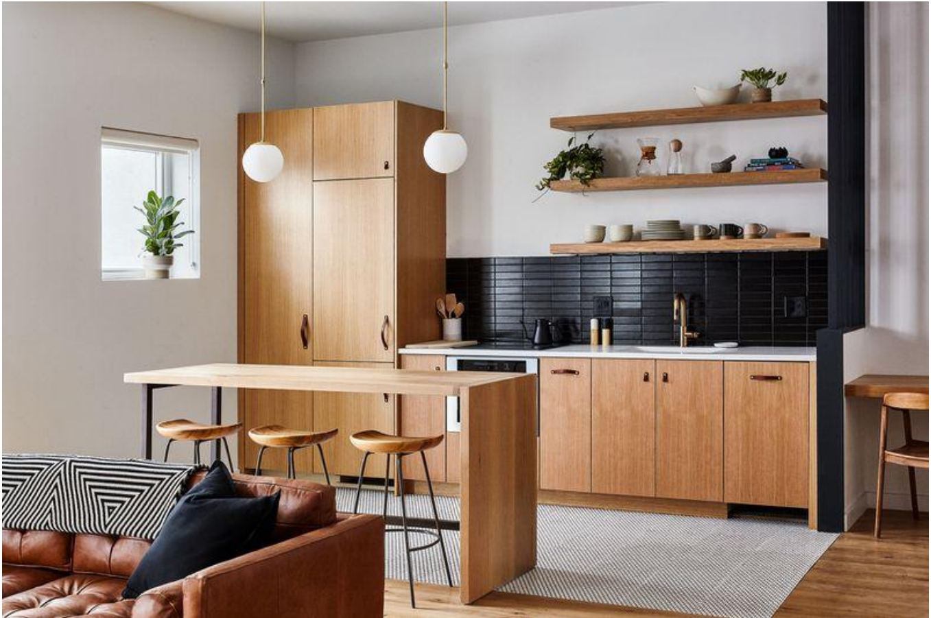
Lokal, a new six-room hotel, feels a lot like Fishtown, the Philadelphia neighborhood where it just opened: Fresh, energetic, and creative.

(keypad check-in, remote staff) that feels like the future. Fuel up on bulging burritos at “LA-style street food” mecca Loco Pez . Consume indie rock and craft beer at beloved hangout Johnny Brenda’s . Philadelphia’s got much more, including Bill Viola’s haunting video art at the Barnes Foundation and magical choreographed fountains in Franklin Square .