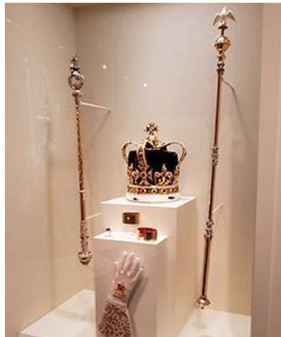
Winterthur "The Crown" display