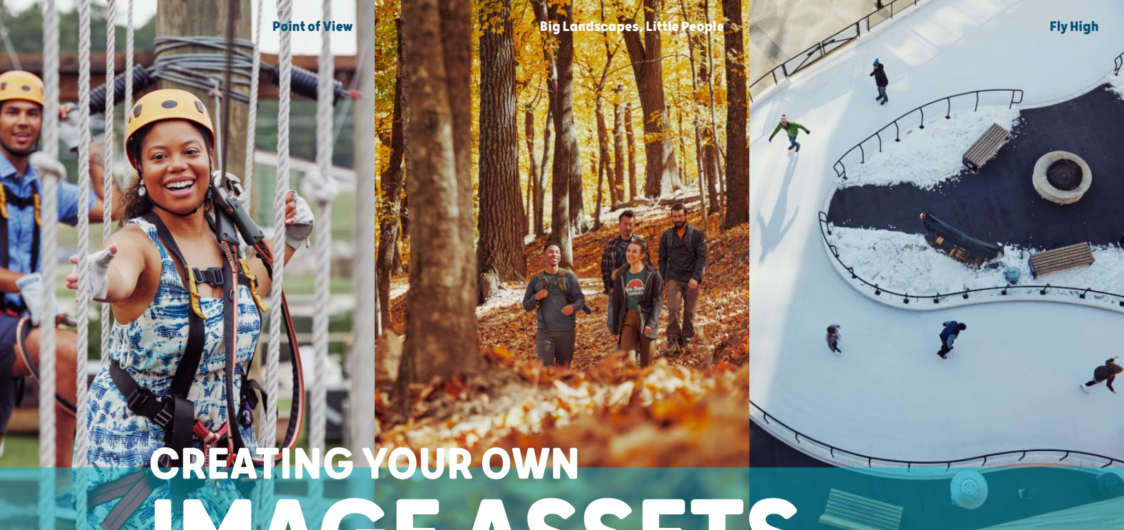
Point of View