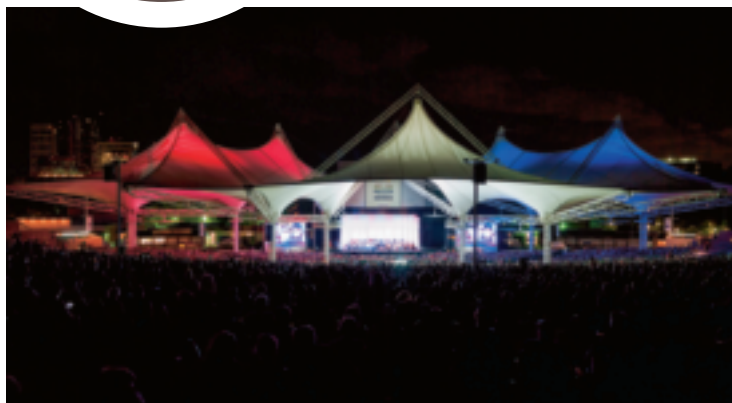
Star-Spangled Salute | Tuesday, July 3, 2018 Cynthia Woods Mitchell Pavilion

Kick off America's birthday and listen to the sounds of the Houston Symphony at this 28-year tradition. With a selection of patriotic favorites including Tchaikovsky's 1812 Overture , the evening would not be complete without the traditional cannons blasting from the hill. While at this free concert, guests are invited to pack a picnic and enjoy their evening. Gates open at 6:30 p.m. with pre-concert activities, the free concert begins at 8 p.m.