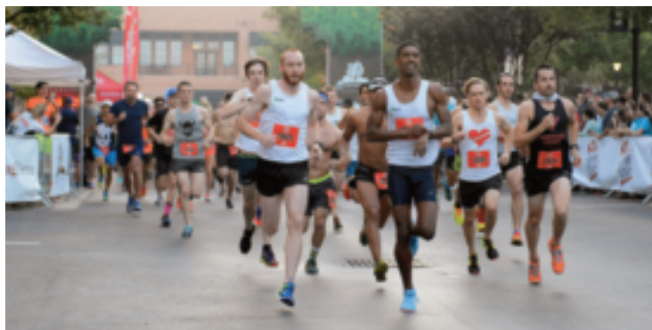
Memorial Hermann 10 for Texas | October 13, 2018

It doesn't have to be a marathon to mark a goal off of your bucket list. As a runner, The Woodlands can be your paradise! With mostly flat terrain and the crisp October air in your face, you can't go wrong with entering the annual Memorial Hermann 10 for Texas race. Produced by The Woodlands Township Parks and Recreation Department, this USA Track and Field sanctioned event, with a certified 10-mile course, will have you beaming as you cross the finish line.