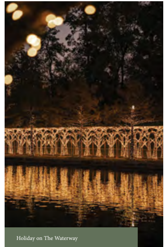
Holiday on The Waterway

For more information, see: www.visitthewoodlands.com .