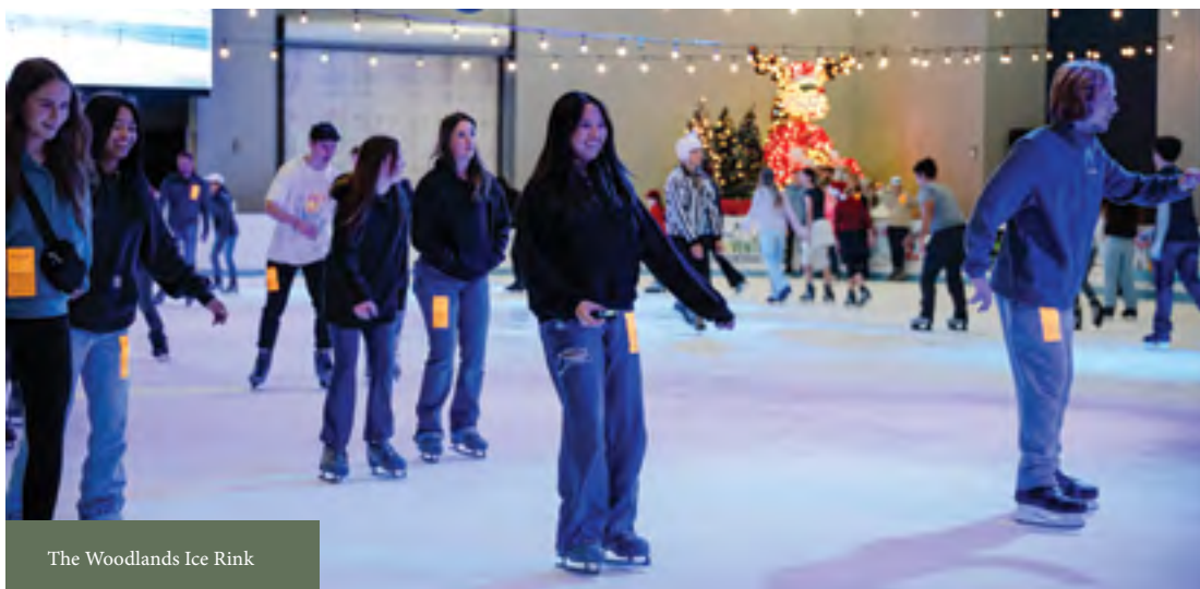
The Woodlands Ice Rink