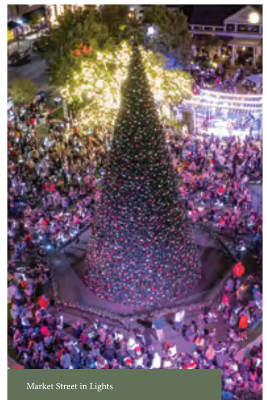
Market Street in Lights