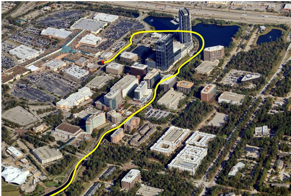
The yellow line indicates the route of the Waterway Cruisers