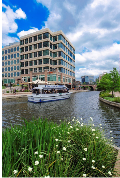
Here are photos of former boats on The Woodlands Waterway