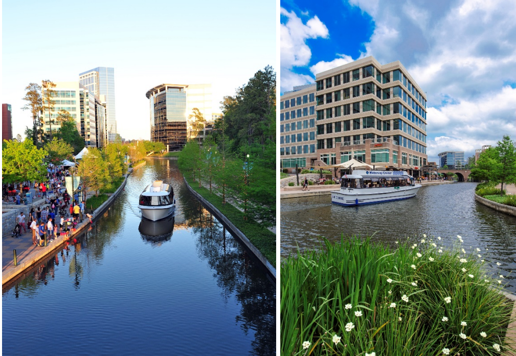
Here are photos of former boats on The Woodlands Waterway