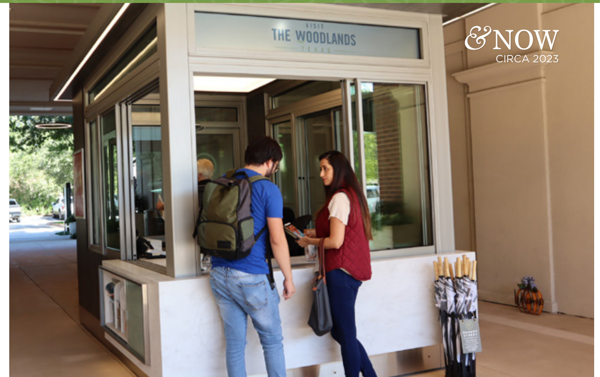
& NOW CIRCA 2023

Whether you're a visitor yourself or have friends and family in town for the holidays, the Visit The Woodlands Visitor Kiosk at Market Street is a great resource for discovering new things to see and do around town. Here, you'll find maps, visitor guides, and more. The Visitor Kiosk is located in the North Commons breezeway (next to CRÚ Food & Wine Bar), across from Market Street's Central Park. Open Monday - Saturday from 11 a.m. to 7 p.m. & Sunday from 12 to 6 p.m.