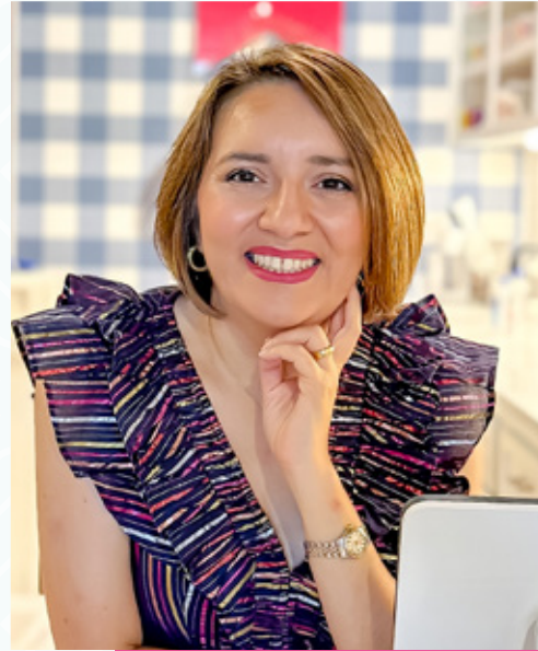
Jen Loves Paper 3759 FM 1488 Suite 450