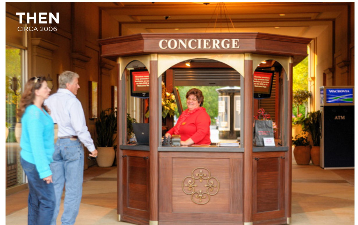
THEN CIRCA 2006

Whether you're a visitor yourself or have friends and family in town for the holidays, the Visit The Woodlands Visitor Kiosk at Market Street is a great resource for discovering new things to see and do around town. Here, you'll find maps, visitor guides, and more. The Visitor Kiosk is located in the North Commons breezeway (next to CRÚ Food & Wine Bar), across from Market Street's Central Park. Open Monday - Saturday from 11 a.m. to 7 p.m. & Sunday from 12 to 6 p.m.