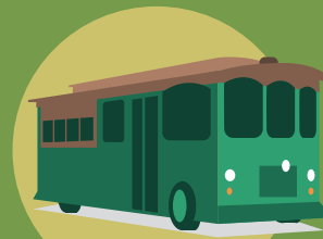
Town Center Trolley

Even in the most urban parts of The Woodlands, you'll find lush parks and green spaces ready to explore and stretch out in. Northshore Park along Lake Woodlands has a playground, picnic spots, large field spaces and volleyball courts. Do as the locals do and spread out a blanket on the grass for one of their free concerts in the spring or fall. Northshore Park also kicks off the swim portion of the IRONMAN Texas Triathlon each April. Besides Northshore, The Woodlands is home to more than 140 free public parks and green spaces to relax or run around in.