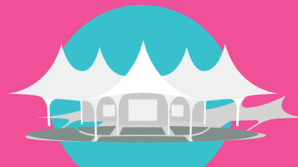
The Cynthia Woods Mitchell Pavilion

Whether you're looking for the best happy hour deals or the hottest social scene, you'll find it all here. Go for an evening of sophisticated pairings at Crush Wine Lounge or Como Social Club Poolside Terrace + Bar , try a craft cocktail at Local Pour or splurge with a cigar at Blend Bar . Let your hair down at social scene pubs like Baker Street or The Goose's Acre .