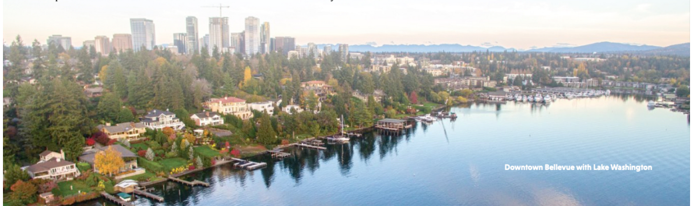
Downtown Bellevue with Lake Washington