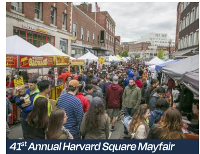
41 st Annual Harvard Square Mayfair

FOR AMERICA 250 EVENTS, VISIT meetboston.com