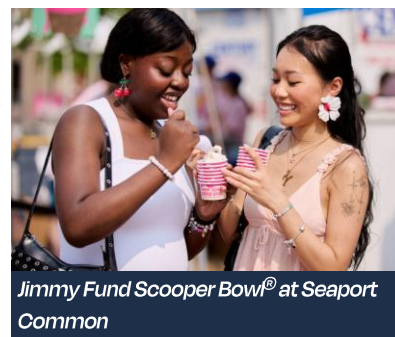
Jimmy Fund Scooper Bowl® at Seaport Common

FOR VEGETARIAN AND VEGAN OPTIONS, VISIT meetboston.com