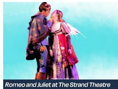
Romeo and Juliet at The Strand Theatre