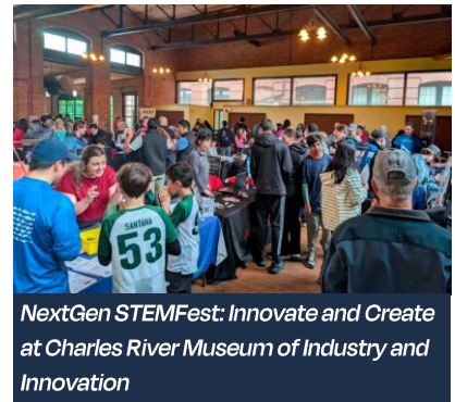
NextGen STEMFest: Innovate and Create at Charles River Museum of Industry and Innovation

View Boston | ongoing | Prudential Center | viewboston.com