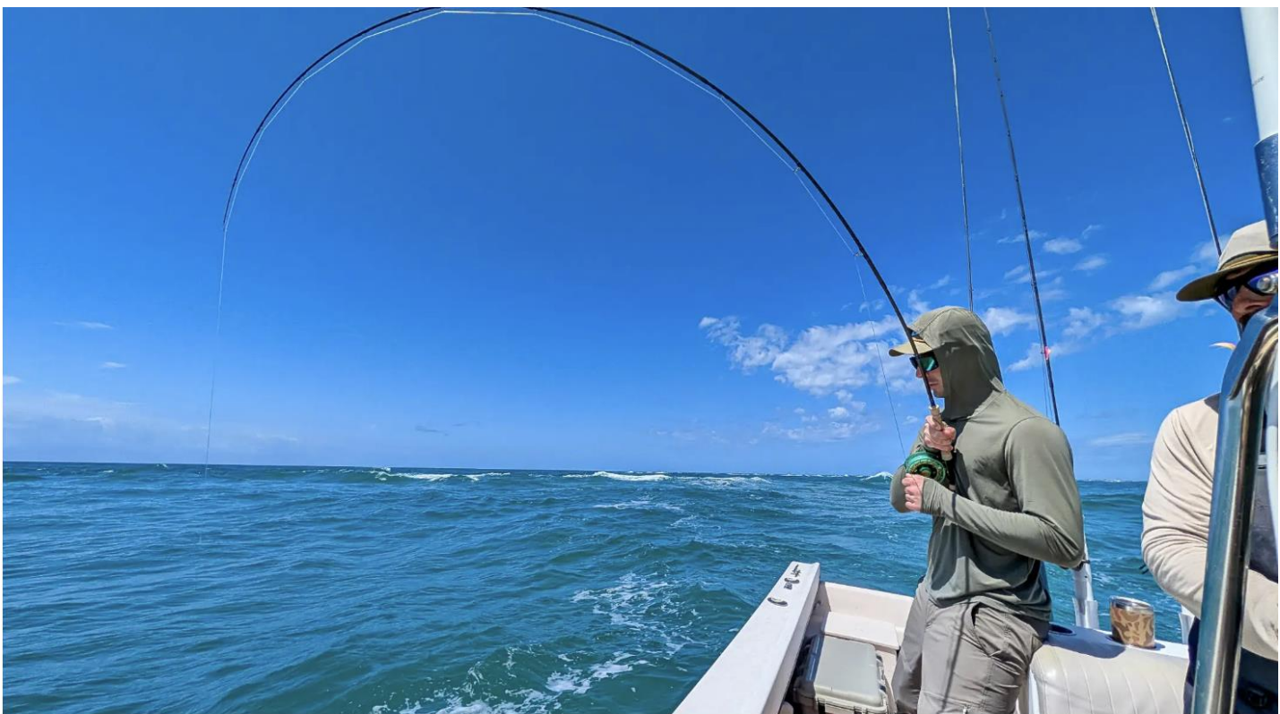
Fighting a bluefish off of North Carolina's Crystal Coast

Fly fishing for redfish, sea trout, bluefish, cobia, false albacore and more on the North Carolina coast.