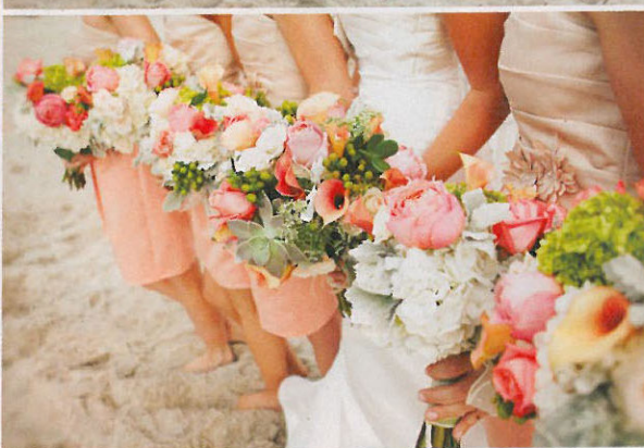
CLOCKWISE FROM TOP: The bridal party showed their excitement in freewheeling style; the bridesmaids' bouquets featured pink and green flowers while the bride's included succulents; the top tier of the couple's red velvet and vanilla cake was garnished with a mint green bow; a photo album of Cory and Fallin's engagement pictures doubled as their guestbook; whimsical round paper lanterns hung from the top of their reception tent.