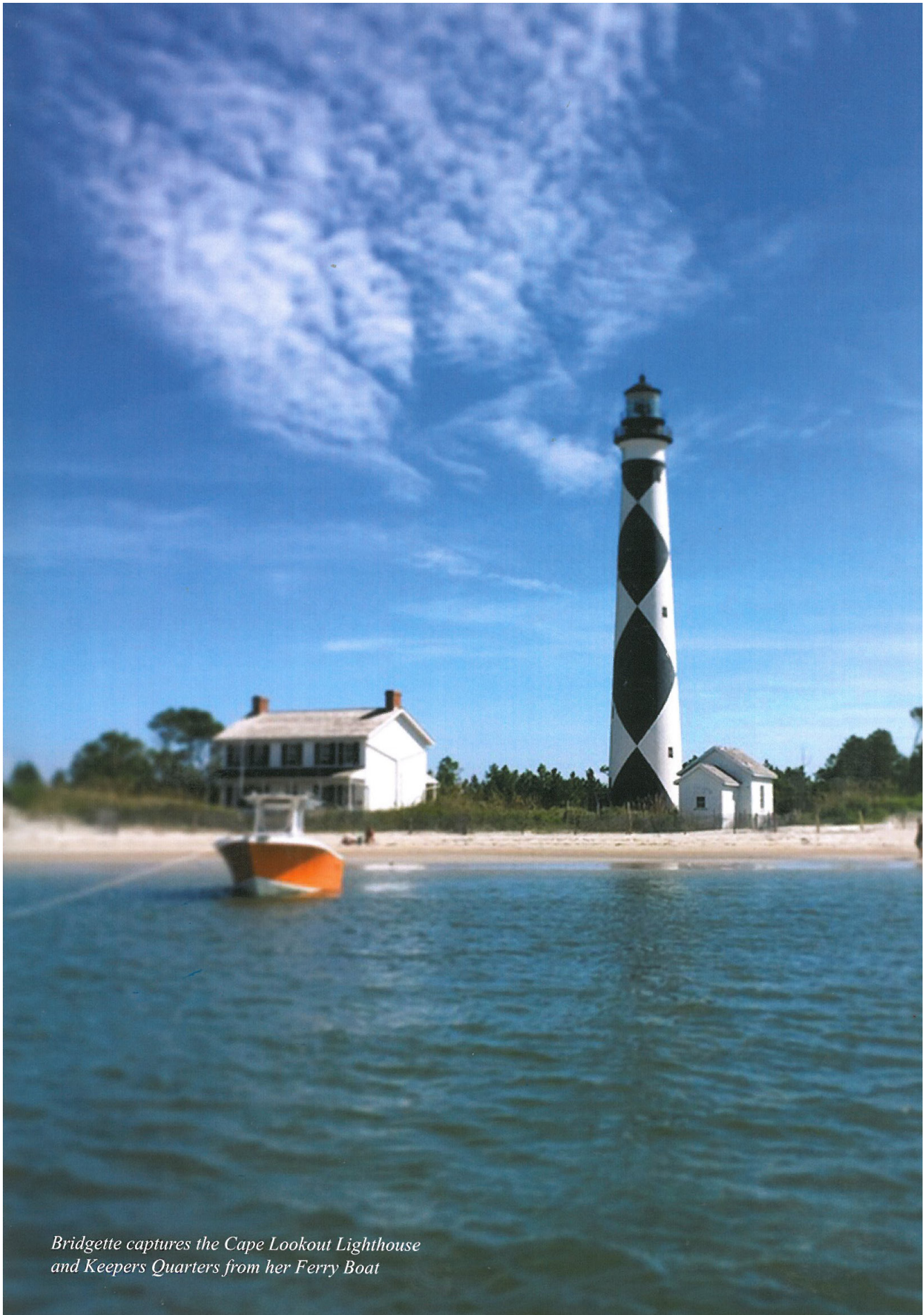
Bridgette captures the Cape Lookout Lighthouse and Keepers Quarters from her Ferry Boat