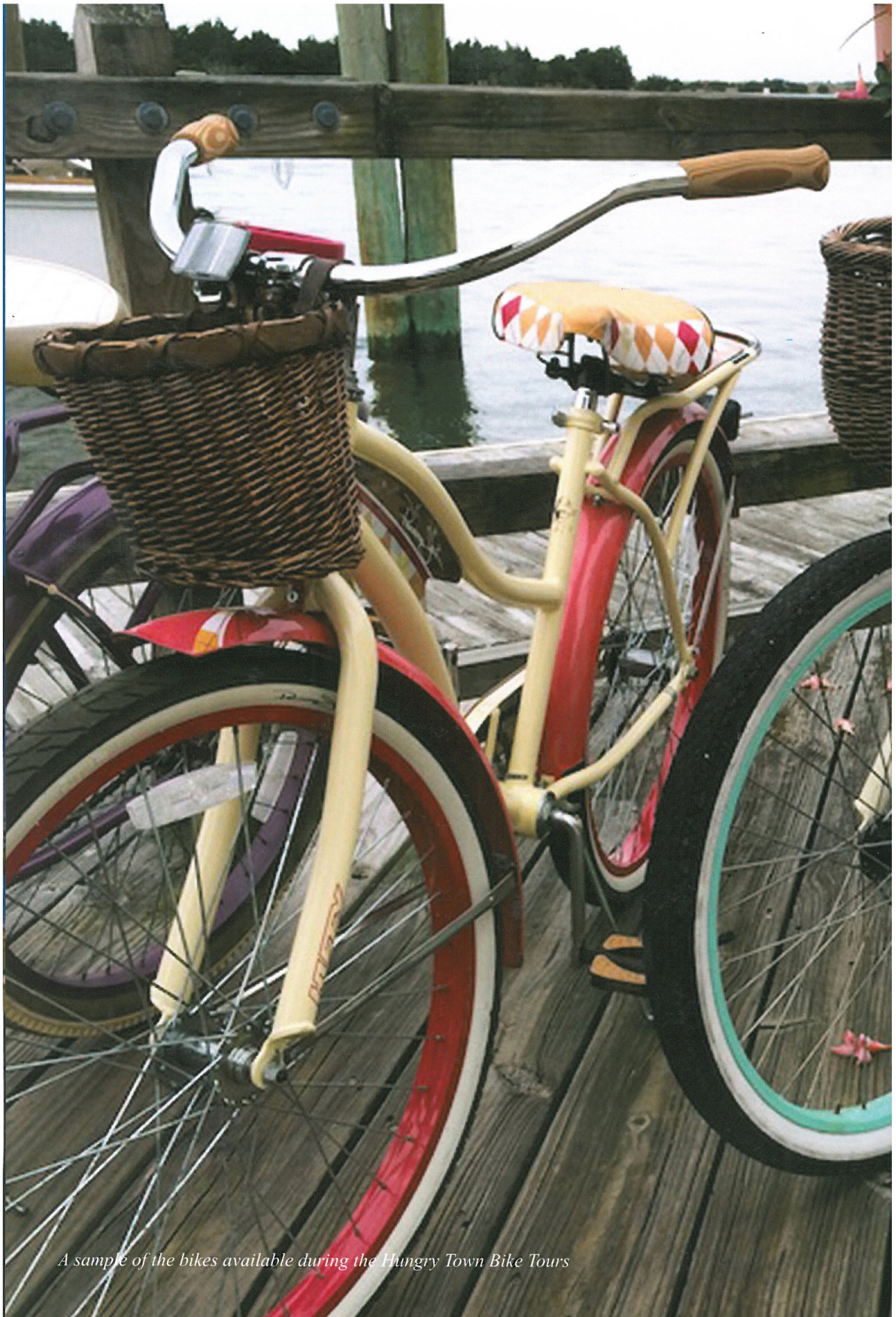
A sample of the bikes available during the Hungry Town Bike Tours