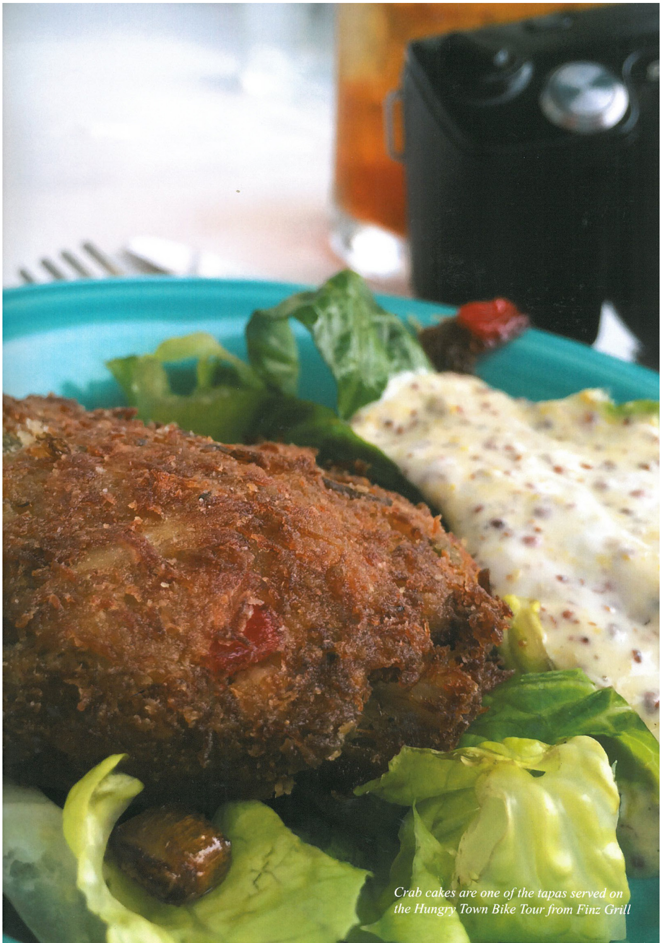
Crab cakes are one of the tapas served on the Hungry Town Bike Tour from Finz Grill