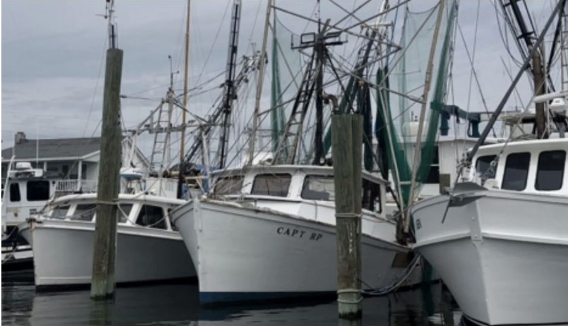
📷 A kayak tour offers a different view of Beaufort

I recommend starting the day strong with a breakfast stop at Turner Street Market , a casual spot that offers breakfast sandwiches, biscuits and gravy, bagels, and more. After breakfast, make the most of your beautiful surroundings with a kayaking tour with Beaufort Paddle . This small, family-owned business will provide everything you need to explore the Rachel Carson Reserve, right down to the water shoes and dry bags. Be on the lookout for wild horses as there are about 30 living on the reserve. You can typically catch them standing in the grass out for a snack.