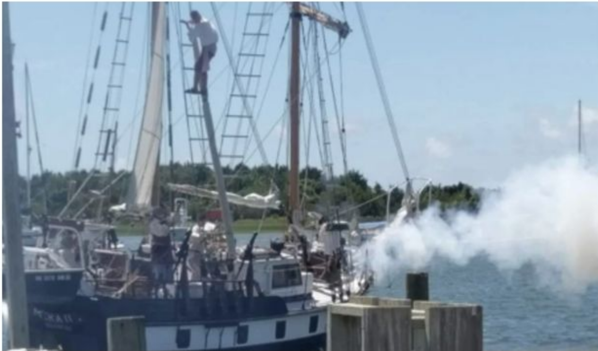
📷 During the Beaufort Pirate Invasion, pirates stage performances on land and sea

On your last vacation day, zoom out for great views of Cape Lookout National Seashore with Island Express Ferry Boat Services . This 50-minute round-trip ferry boat ride takes you to Cape Lookout, where you have a chance to spot sea turtles, dolphins, and wild horses (I love this combination). You'll also get great views of the Cape Lookout Lighthouse and many beaches. Take your time exploring what the Lookout has to offer. If you're an adrenaline junkie, Island Express Ferry Boat Services also provides UTV rentals for you to further explore the island.