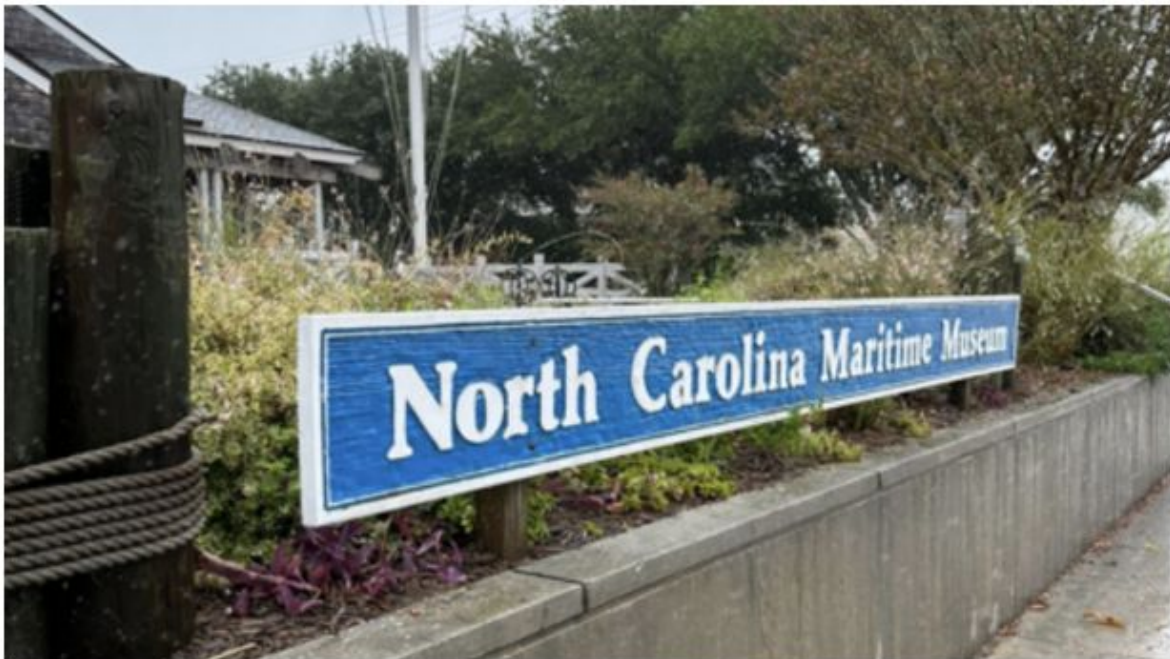
📷 The North Carolina Maritime Museum tells a big part of the local history of pirates

Another morning means another chance to eat breakfast, and you can't go wrong at Mug Shot . This cafe and lounge is known for tasty biscuits and gravy and a variety of housemade coffee syrups.