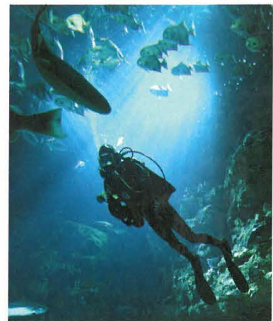
The Crystal Coast is a scuba diver’s dream where you can explore underwater freighters, crafts of all kinds and a World War II German U-boat. There’s a reason this area is known as the “Graveyard of the Atlantic.”

just west of Atlantic Beach. Nimbus, a rescued white sea turtle, lives here. Big and little kids will have an educational ball conducting diagnostics and giving treatment to sick and injured mock turtles in the “Sea Turtle Rescue” hospital. (252) 247-4003, www.ncaquariums.com/pine-kill-shores .