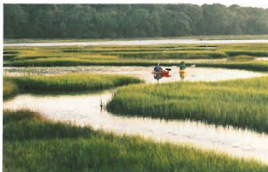
From estuaries to ocean lanes, the Southern Outer Banks claims the most kayaking trails in North Carolina.

1826 after the War of 1812 proved how vulnerable American coasts were to enemy attack. The site is now a state park hosting tours, battle re-enactments, an education center and concerts. Find the fort, on-the-double, in Atlantic Beach, (252) 726-3775, www.ncparks.gov .