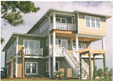
Mammoth beach houses are known to locals as “sand castles,” offering breathtaking views of the Atlantic Ocean and Bogue Sound.

celery. Simple and delish—dashboard dining at its best. Cash only. (252) 726-3002.