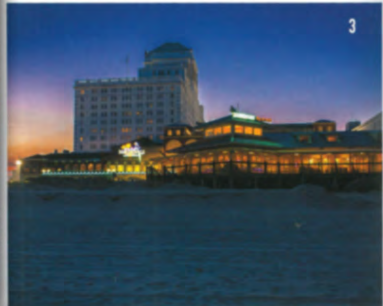
1 BEACH ON THE CRYSTAL COAST 2 LOBBY AT GIDEON PUTNAM HOTEL 3 LANDSHARK BAR AND GRILL – ATLANTIC CITY