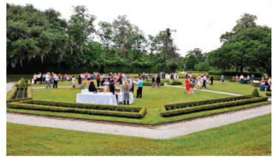
MIDDLETON PLACE, CHARLESTON

Middleton Place, a National Historic Landmark that includes 65 acres of gardens, an