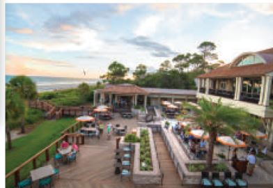
COAST, HILTON HEAD ISLAND

The restaurant is located within the Sea Pines Resort, a 5,000-acre enclave with private homes, The Inn & Club Harbour hotel