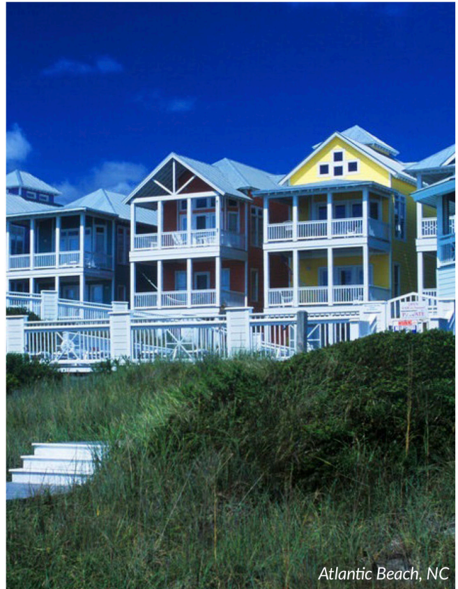
Atlantic Beach, NC

This ocean front oasis is complete with a swimming pool, jacuzzi, bbq grill, private balcony dining area, and an expansive and modern kitchen. A-1 derful Life creates a luxurious retreat in one of the most exquisite settings.