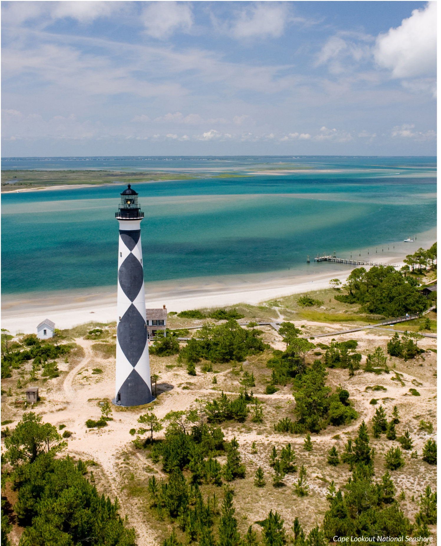
Cape Lookout National Seashore