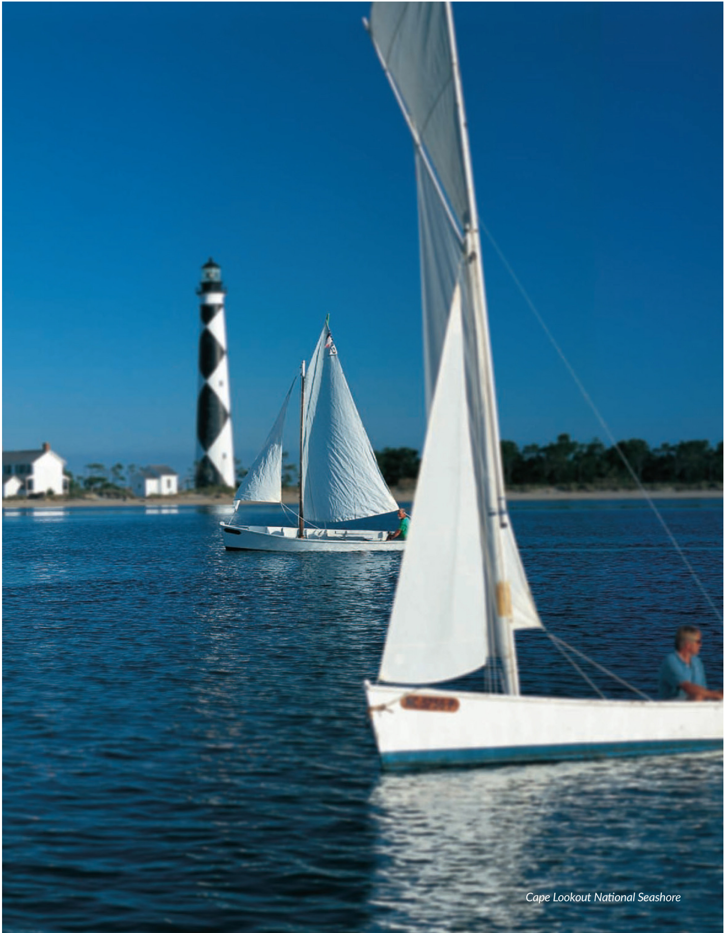
Cape Lookout National Seashore