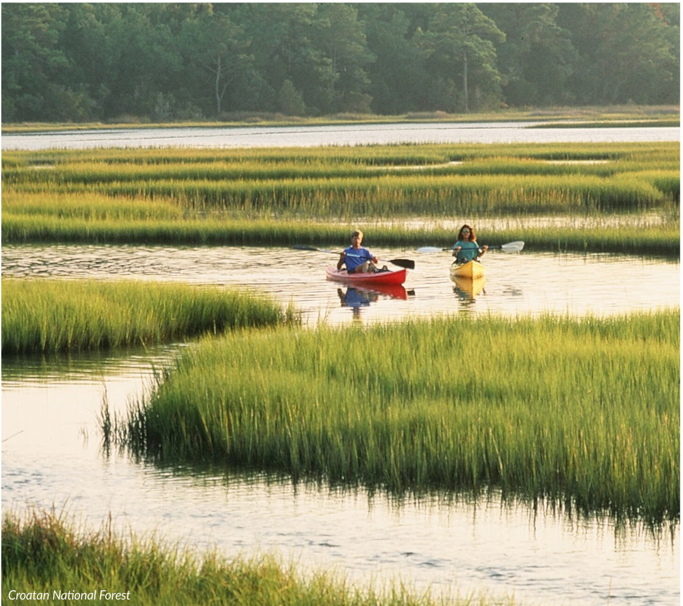
Croatan National Forest

A visit to the area is not complete without stops the Maritime Museum, Old Burying Grounds, Fort Macon State Park or the North Carolina Aquarium at Pine Knoll Shores.