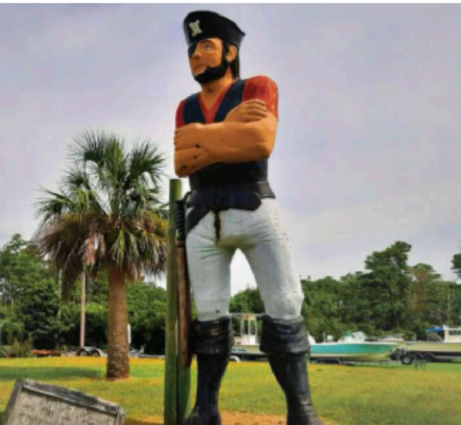
Above: A statue of Blackbeard stands proudly on the outskirts of Beaufort.